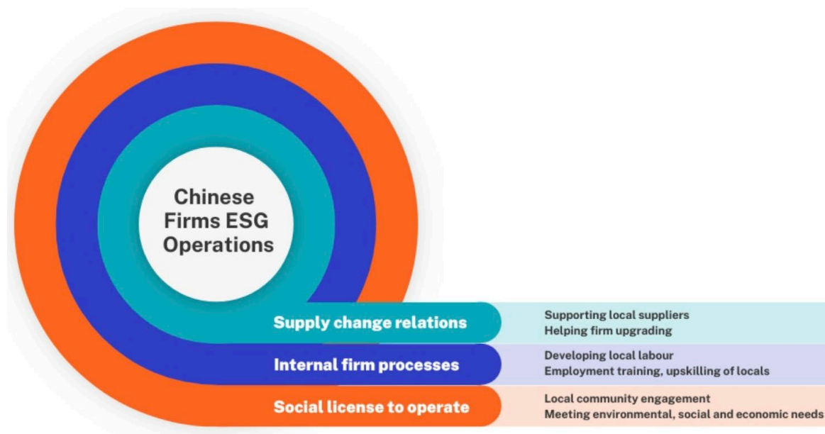
Figure 2: A framework analysing Chinese firms and ESG