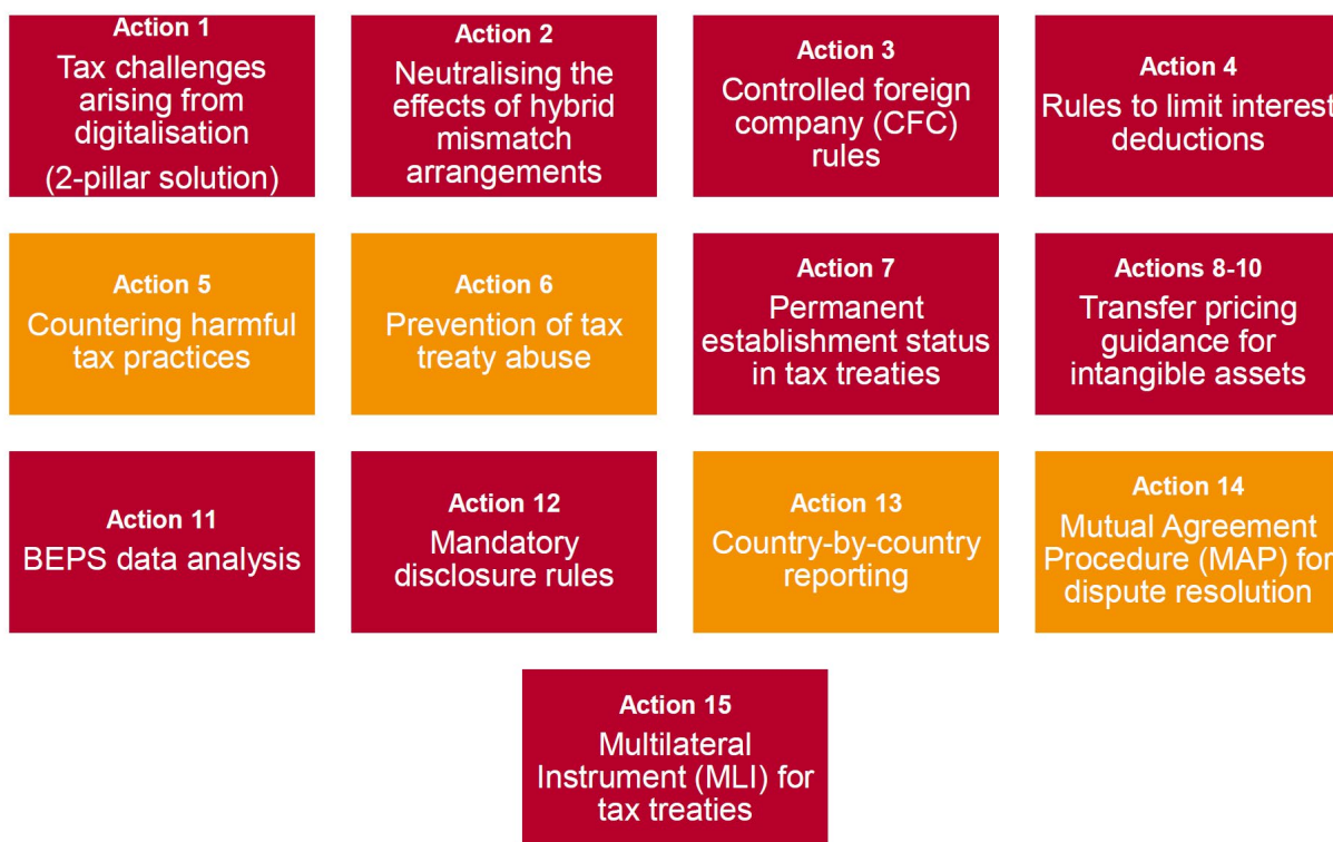
Figure 1: BEPS Action Plan

Note: Minimum standards that all Inclusive Framework member countries need to fulfil are in orange.