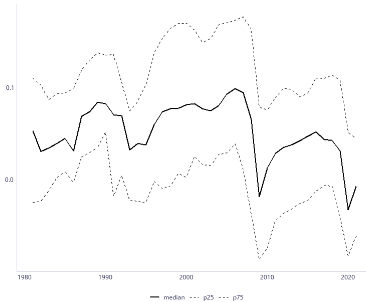
Figure 2: Developments of the fiscal response coefficient, 1980-2021