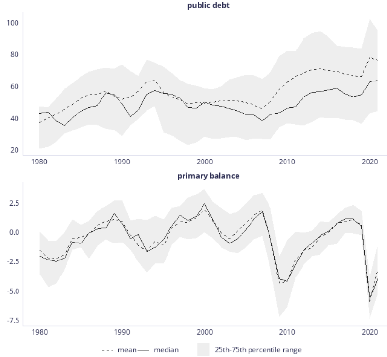
Figure 1: Primary balance and public debt in OECD countries, 1980-2021