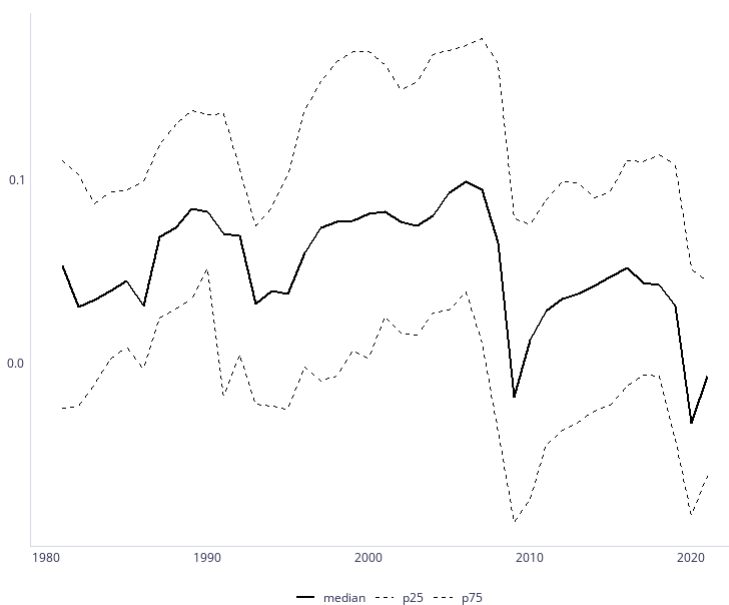
Figure 2: Developments of the fiscal response coefficient, 1980-2021