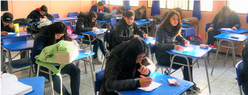
Figure A1: Example of the data collection setup. The data collections were conducted by trained field-workers during regular schooling hours. The data collection took place in form of a self-administered paper pencil survey. During the interview students were sitting in a standardized seating order and were not allowed to talk in order to prevent interactions.