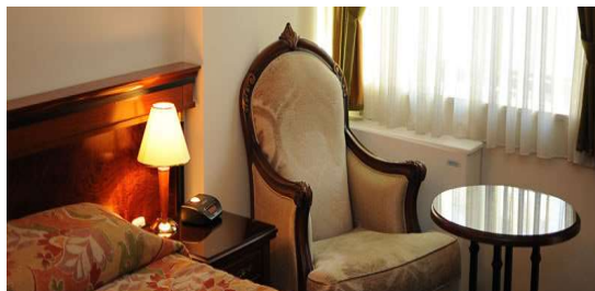
Figure 2. Standard room

Equipment: air conditioner, mini bar, wireless internet, direct telephone line, cable TV, bathroom with shower cabin or bathtub.