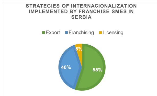
Figure 2. Strategies of internationalization implemented by franchise SMEs in Serbia

The results of research show that almost 2/3 of the analyzed franchise SMEs in the Republic of Serbia decide to enter the foreign market, while 37.5% operate within the borders of Serbia. Based on the respondents' answers, it is concluded that in relation to the total number of companies analyzed, 34.4% of franchised SMEs use export, 25% franchising and 3.1% licensing as an internationalization strategy. Observed only within franchised SMEs that operate internationally, more than half of the analyzed companies decide to export their products to foreign markets (55%), 40% apply franchising and 5% licensing (Figure 2).