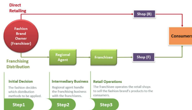
Figure 1. Fashion distribution channels

The importance of franchising in fashion can be seen in the fashion distribution channels, consisting of franchising distribution and direct retailing (Chen, Chung & Guo, 2020; Cai et al., 2019). The first channel, direct retailing, refers to shops owned and managed by fashion brand owners. The second channel, franchising distribution, refers to distribution from fashion brand owners through regional agents to franchisees. (Figure 1).