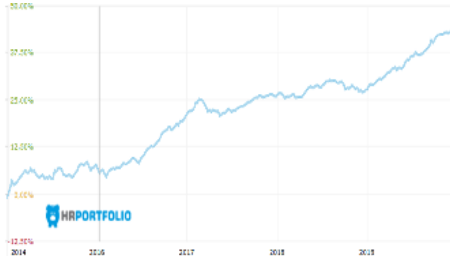
Figure 2. MIREX A values for the period 2015-2019. (Source: hr.portfolio 2020)

Figure 2 shows MIREX A indices for the period 2015-2019 and a continuous asset growth in Category A funds. The asset growth caused by constant positive returns may be associated with an increased weight of assets allocated to stocks, which is illustrated by Figure 1.