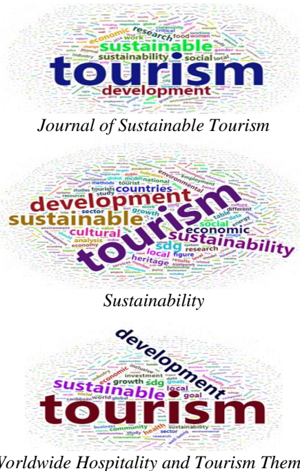
Figure no. 2. Relevant topics addressed in the most relevant journals

Worldwide Hospitality and Tourism Themes Journal provides a niche in the field, addressing themes such as “community”, “health”, “well-being”, “investment”, “growth”, and “inclusivity”. This suggests that the journal explores community involvement and development in the hospitality and tourism industry, the intersection between tourism and health/well-being, investment strategies and opportunities, industry growth trends, and approaches to promote inclusivity (Figure no. 2).