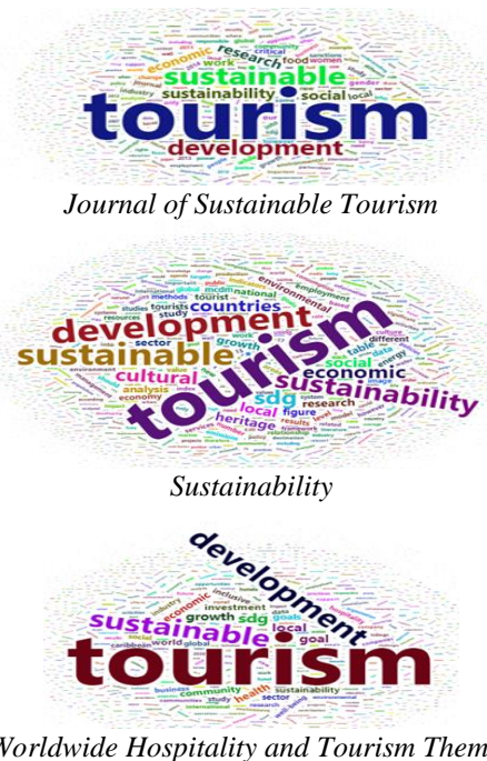
Figure no. 2. Relevant topics addressed in the most relevant journals

Worldwide Hospitality and Tourism Themes Journal provides a niche in the field, addressing themes such as “community”, “health”, “well-being”, “investment”, “growth”, and “inclusivity”. This suggests that the journal explores community involvement and development in the hospitality and tourism industry, the intersection between tourism and health/well-being, investment strategies and opportunities, industry growth trends, and approaches to promote inclusivity (Figure no. 2).