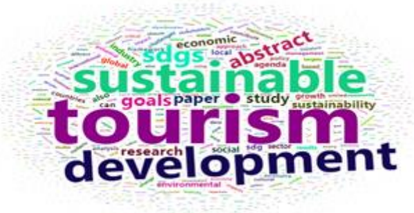
Figure no. 3. Most frequently used words in the abstracts of scientific publications

The word network has highlighted key points such as “development”, “tourism”, “objectives”, “research”, “paper”, “Agenda 2030”, “environment”, “development goals”, “results”, “policies”, and “approach.” These central points signify key concepts and areas of interest in the specialised literature, indicating the interconnection and interdependence of these terms in understanding the relationship between tourism and SDGs.