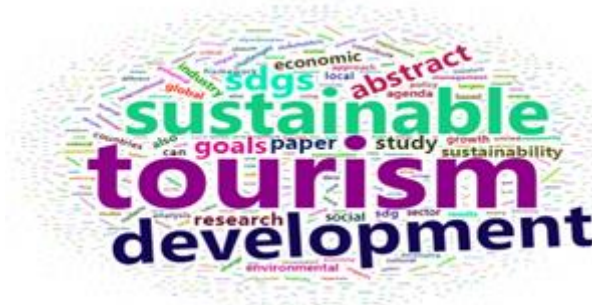
Figure no. 3. Most frequently used words in the abstracts of scientific publications

The word network has highlighted key points such as “development”, “tourism”, “objectives”, “research”, “paper”, “Agenda 2030”, “environment”, “development goals”, “results”, “policies”, and “approach.” These central points signify key concepts and areas of interest in the specialised literature, indicating the interconnection and interdependence of these terms in understanding the relationship between tourism and SDGs.