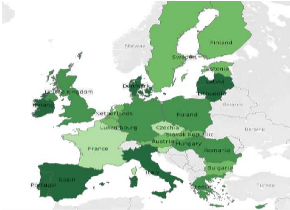
Figure no. 1. Distribution of EU countries according to the normalised difference between the percentage of renewable energy and energy consumption per inhabitant

intermediate situation, in which green energy production is positively correlated with domestic consumption. Figure no. 1 points out that there is no geographical grouping of these behaviours. Practically, heterogeneity is very high in each group, both in terms of geographical position on the continent, national income, the abundance of internal energy resources, etc. As a result, the phenomenon is much more complex, and in order to better characterise the behavioural patterns of countries, economic, institutional, and cultural factors must be taken into account simultaneously.