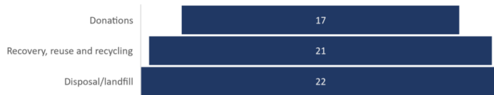
Figure no. 3. The frequency of codes regarding the destination of waste within the food supply chain

Food waste can be reduced by donating, recovering, reusing, and recycling perishable food. As a last resort, food waste can be transferred to the landfill, which is not desirable. Figure no. 3 presents the frequencies of information regarding waste destinations in the reports of the sampled companies. The stage entitled "Transfer to landfill" includes information on the amounts discarded and initiatives to reduce the proportion of food wasted at various stages of the distribution cycle. Value chains in the food industry have characteristics that could be assimilated to the circular economy (Slorach et al., 2019), but there is a significant amount of food that is wasted and cannot be turned into any other resource. In these circumstances, an integrated approach must focus on maximizing the circular nature of the value chain in the food industry, by minimizing the proportion of food that is wasted.