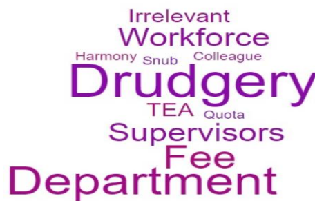
Figure no. 4. The participants' assessment of SWP in word cloud

In terms of work placement relevance, students majoring in social sciences said that the jobs they did were more closely related to their fields of study. For example, a male participant aged 23 from Ankara stated I'm studying sociology. I've worked in social services, and the job I've worked was closely related to my major. Additionally, students who have worked in humanities and social sciences areas such as psychology, social services, and call centers have higher scores on the field of study-work placement correspondence. On the other hand, students who have been studying engineering, science and languages complain about having little overlap between their field of study and the work placement. For example, while a 21-year-old female participant from Ankara says I'm studying Molecular Biology and Genetics. I've been appointed to a nursing home. I've made photocopies of documents and filled in record books all through my work experience. Another 20-year-old female participant from Burdur has stated that there is no relationship between my work placement and the field of my study. I'm studying Teachers of English to Speakers of Other Languages (TESOL). The institution I've worked at was a youth center. If you ask me what I did, I've served tea and copied documents... The word cloud gathered from the students' assessments of SWP also supports these statements (figure no. 4).