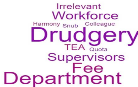
Figure no. 4. The participants’ assessment of SWP in word cloud

In terms of work placement relevance, students majoring in social sciences said that the jobs they did were more closely related to their fields of study. For example, a male participant aged 23 from Ankara stated I’m studying sociology. I’ve worked in social services, and the job I’ve worked was closely related to my major. Additionally, students who have worked in humanities and social sciences areas such as psychology, social services, and call centers have higher scores on the field of study-work placement correspondence. On the other hand, students who have been studying engineering, science and languages complain about having little overlap between their field of study and the work placement. For example, while a 21-year-old female participant from Ankara says I’m studying Molecular Biology and Genetics. I’ve been appointed to a nursing home. I’ve made photocopies of documents and filled in record books all through my work experience. Another 20-year-old female participant from Burdur has stated that there is no relationship between my work placement and the field of my study. I’m studying Teachers of English to Speakers of Other Languages (TESOL). The institution I’ve worked at was a youth center. If you ask me what I did, I’ve served tea and copied documents... The word cloud gathered from the students' assessments of SWP also supports these statements (figure no. 4).