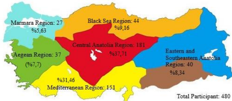
Figure no. 2. The regional distribution of the cities where the participants worked

The SWP was put into practice for the first time in Turkey during the June-September 2019 period. 20,000 students benefited from it in the first year. According to this, the research population comprised of 20,000 students. In the instance of a 20,000 person, the primary audience, the population size is calculated to be 377 participants for a 95% confidence interval with a 5% error margin (Krejcie and Morgan, 1970). Based on this, a student group of 500 people from seven regions of Turkey has been randomly chosen for research (figure no. 2).