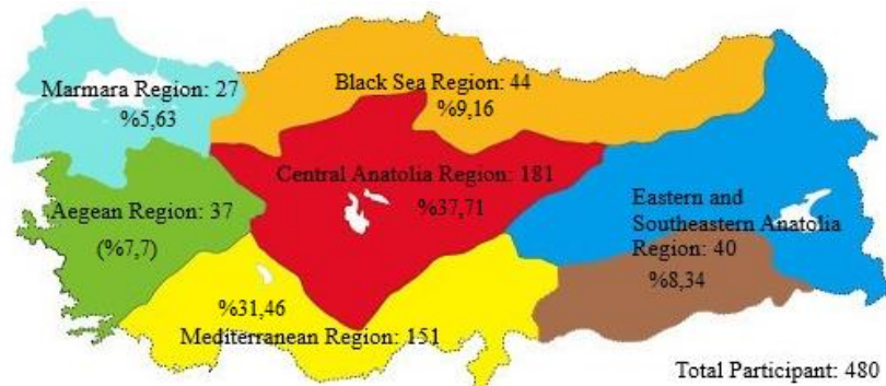
Figure no. 2. The regional distribution of the cities where the participants worked

The SWP was put into practice for the first time in Turkey during the June-September 2019 period. 20,000 students benefited from it in the first year. According to this, the research population comprised of 20,000 students. In the instance of a 20,000 person, the primary audience, the population size is calculated to be 377 participants for a 95% confidence interval with a 5% error margin (Krejcie and Morgan, 1970). Based on this, a student group of 500 people from seven regions of Turkey has been randomly chosen for research (figure no. 2).