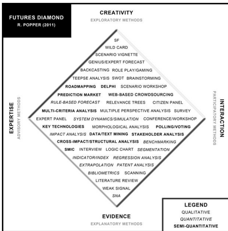
Figure no. 2. The Foresight Diamond (collection of foresight methods)