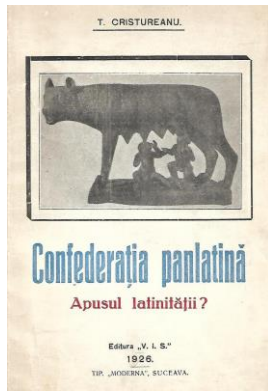
The debut book printed in 1926 by V.I.S. Printing House in Suceava