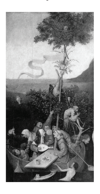
Fig. 1. Detail from Hieronymus Bosch, Ship of Fools (1490–1500)