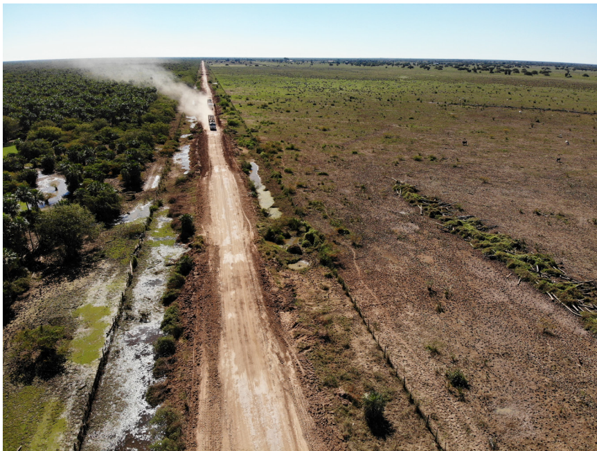
FIGURE 17. Simplifying landscapes for cattle ranching. Recent deforestation (right) lays bare pasturelands just outside the Xákmok Kásek land (left), while two semis full of cattle kick up dust as they travel to local slaughterhouses. Photo by author, February 2020.

cattle ranching, then how the social-spatial relations of power produced through that system persist to the present through the politics of recognition and the ways that state officials govern Indigenous affairs. In so doing, I sought to show how a specific facet of the current conjuncture—the cattle ranch—has reconfigured life. Latin American studies scholars have long examined the role of economies and haciendas in structuring social relations of power and development. 5 Further, the geographer Wendy Wolford queries the contemporary proliferation of plantation systems to suggest that “the long-distance simplification of landscapes; alienation of land and labor; and transportation of genomes, plants, animals, and people” is tied to race-based systems of modernity and coloniality. 6