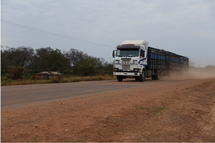
FIGURE 9. A semi hauling cattle kicks up dust as it speeds through Yakye Axa on Ruta 5.

It is a well-known story. They know of it all over. I have a lot of experience. Like I said, I grew up on the side of the road, and there has been a lot of suffering. And this. In the middle of this suffering, I have knowledge. We will one day achieve what we want. As I understand in normal terms, the normal person, as I understand it, no one wants the past suffering. Do you understand? For that reason, I say that I have the experience from the middle of the suffering, the crisis, the persecution. I say that to you because we live like we are isolated, like we are in prison, in the desert. So I have the experience of how we have lived, and I want to teach that so that we do not live it again as we did in the past . . .