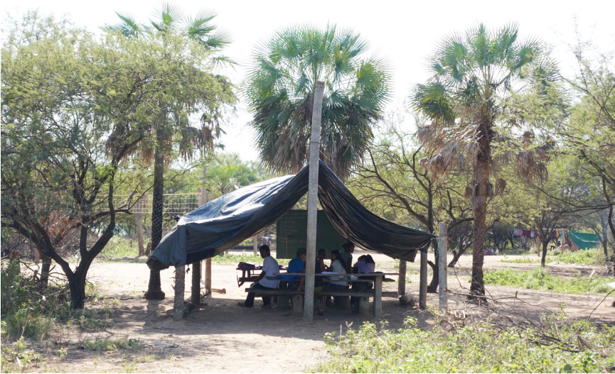
FIGURE 14. This school was one of the first structures built after the reoccupation of Retiro Primero. Photo by author, March 2015.

of algarrobo trees that offered shade and some protection from the elements. The temporary establishment was intimate. Shelters were constructed close to one another. Privacy was fleeting, as most shelters did not have four walls but were open to the air on each end like a quickly constructed tent.