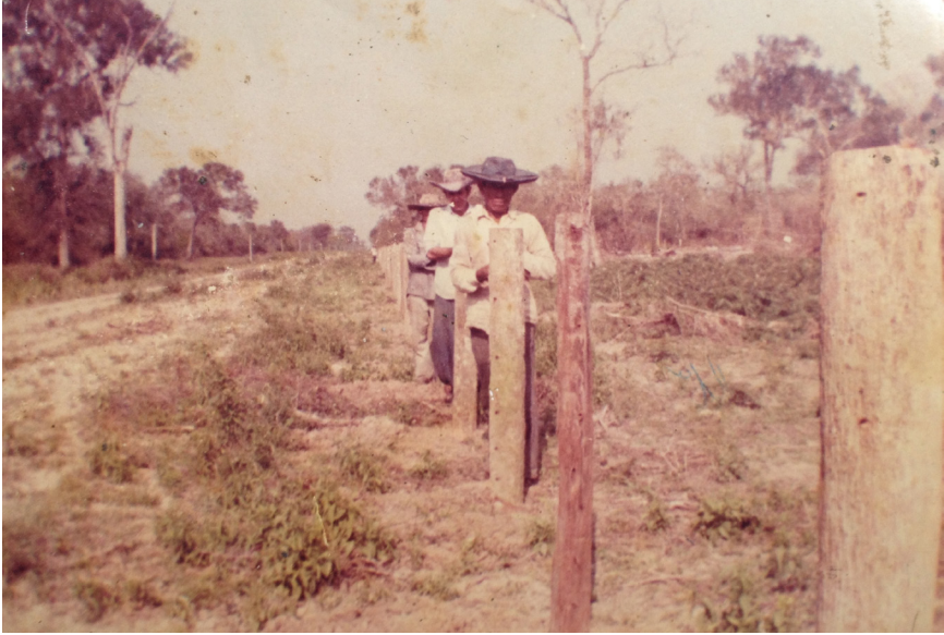
FIGURE 5. Enxet laborers working on Estancia Loma Porã circa 1990, setting fence posts and preparing to string wire fencing.

working: horseback, fences, cleaning land. There wasn't anything I couldn't do. And now, I can't do much of anything. That is how I lived." 15