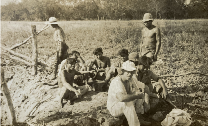
FIGURE 3. Sanapaná men and their Anglican supervisor taking a break while digging a well near Campo Flores, circa 1939.