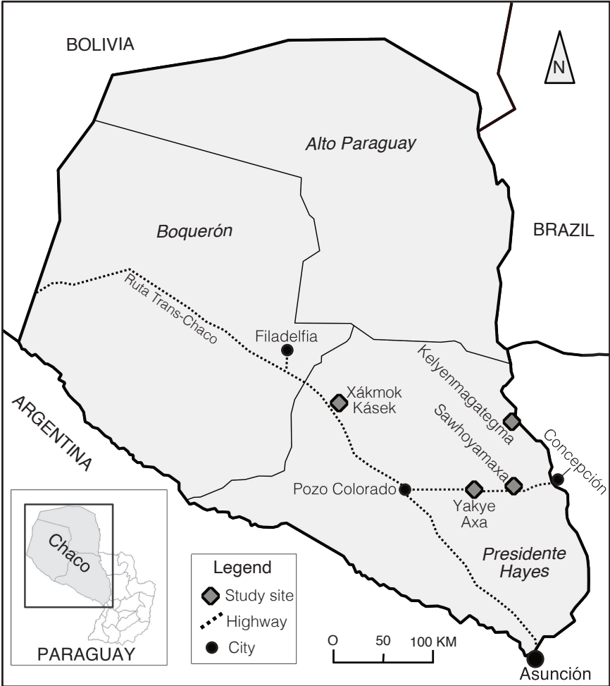
MAP 1. The Paraguayan Chaco and primary study sites. Elaborated by author.