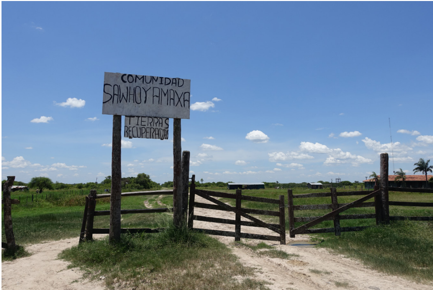
FIGURE 10. The entrance to Sawhoyamaxa. Community members painted over the sign that once read, “Estancia Michi,” to proclaim the lands recovered. The retiro that ranchers refused to cede and that was used to surveil community actions can be seen at the right. Photo by author, February 2016.

dangerous.” 1 Despite its latent threat, Ruta 5 now has a different character. After reoccupying their lands in 2013, almost everyone in Sawhoyamaxa moved away from the roadside, although a few stayed to operate small stores. Whereas many people once viewed the roadside as a carceral space, for many in Sawhoyamaxa it is now a shared space for social exchange and diversion.