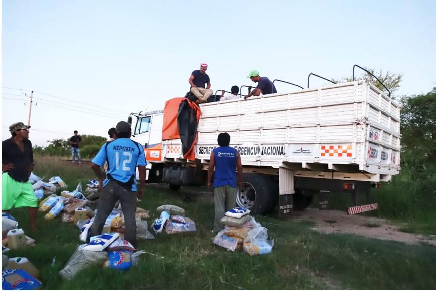
FIGURE 8. The SEN truck and ration distribution in the 16 de agosto aldea of Sawhoyamaxa. A SEN functionary sits atop the truck watching community members hoist and unload the provisions.

because they didn't want to pay for the gas to carry clean water from Concepción. The trucks are heavier when full of water, so they use more gas. The drivers were sneaky. They would fill the trucks with dirty water on a ranch nearby and keep the extra money for the gas. They haven't given us water in a long time."