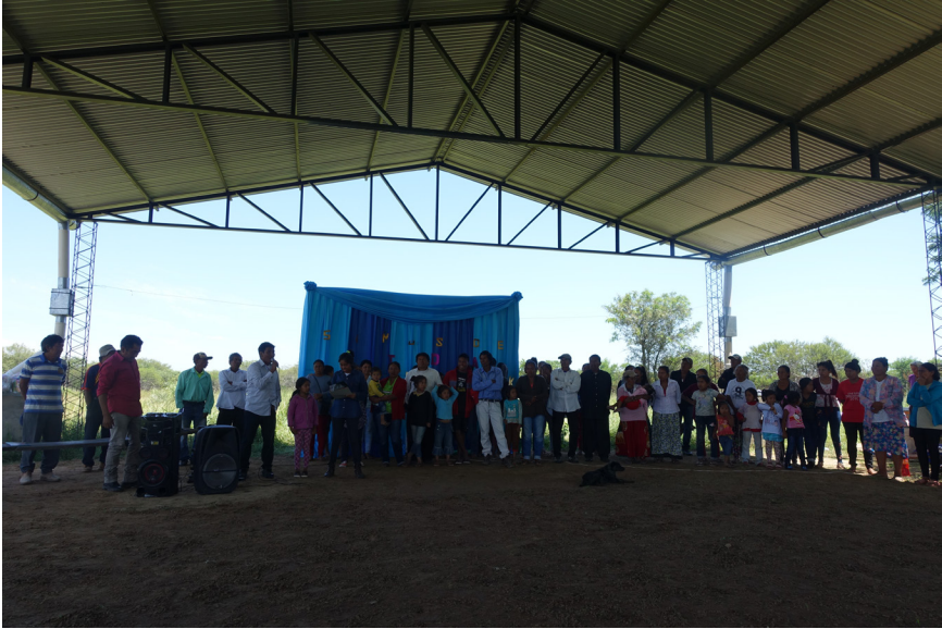
FIGURE 13. Milciades commemorating the “heroes” of XákmoK Kásek during the five-year anniversary of the land reoccupation. Photo by author, February 2020.

pressure from the land reoccupation and purchased 7,701 hectares that encompass Retiro Primero and Mopey Sensap for the community in 2017, partially complying with the community’s claim and IACHR recommendation of 10,001 total hectares. With the purchase of the land, new state-led development projects that had not been envisioned in the IACHR restitution as development strategy soon followed. One project, by the National Service for Environmental Sanitation (SENASA), aims to provide greater water security via the construction of rain-water storage tanks at key sites in the community. Through a different project led by the Ministry of Urbanism, Housing, and Habitat initiative called Che Tapyi, nearly every family now has a two-room home constructed of brick with a tin roof and wired for the eventual arrival of electricity. While state officials like to suggest that they execute these projects to comply with the IACHR ruling, such claims are misleading. Che Tapyi is a national antipoverty initiative funded by Taiwan, whereas SENASA is leveraging a World Bank loan to improve water access in thirty-one Indigenous communities in the region. 10 On the other hand, community members have used restitution-as-development funds to purchase strategic shared resources like a truck that serves as an ambulance, a tractor and other necessary implements to maintain roads within the territory and till fields, a communal cattle herd, and sheep or goats for every family. However, one of the