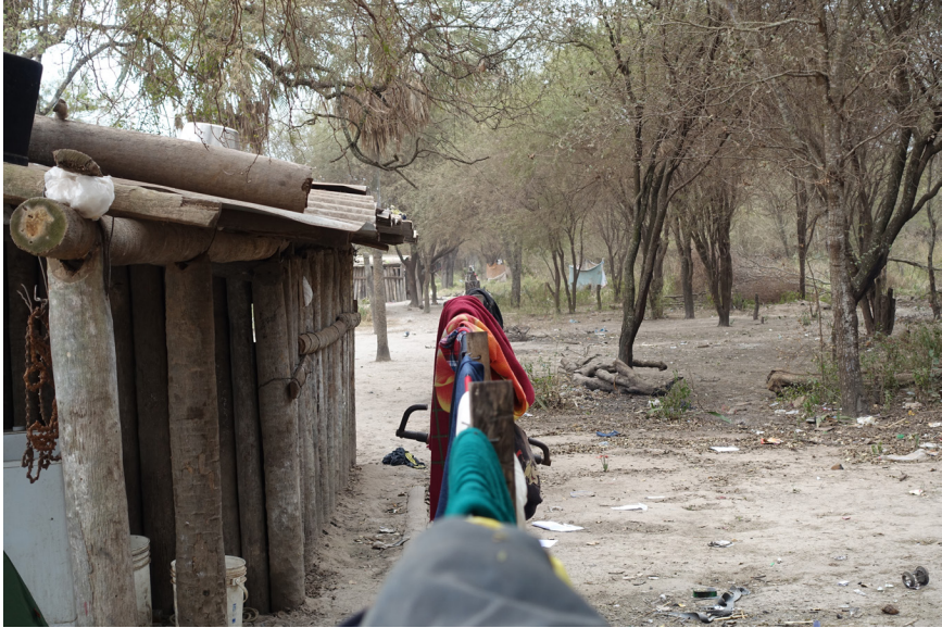
FIGURE 11. The fence that separates members of Yakye Axa from the lands that contain the site of yakye axa. Photo by author, July 2016.

are regularly flooded. On one wet day, I spoke with Inocencia, who described the effect of the rains: “You see? When it rains, there is mud everywhere. My house fills with mud. Just like pigs. That is how they [state officials] think of Indigenous people, like we are animals. They leave us here to suffer instead of giving us what the law says is ours, our land.” 43 The cargo trucks that careen down Ruta 5 hauling cattle, carbón , and contraband pose a lethal threat to the people of Yakye Axa. Passing traffic has struck, killed, and maimed several people during Yakye Axa’s tenure on the margin. Unlike the fast-moving traffic, there is a commonplace slow violence. Basic illnesses become grave threats. The promise of leaving the road one day brings hope but also the enduring trauma of uncertainty. Despite the urgency of the challenges that confront Yakye Axa, which are well known, state authorities have only haltingly implemented restitution as development. 44