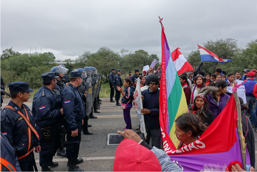
FIGURE 15. Day two of the road closure immediately following the skirmish with riot police on the highway whence the police inadvertently helped block the road. Photo by author, July 2015.

face-to-face with the protesters and inadvertently closed the road. The scene was chaotic and the sound intense as the previously calm protest momentarily erupted. Xákmok Kásek leaders began delivering statements about Indigenous rights and the IACHR judgment over portable loudspeakers that crackled and popped under the strain of the volume. The Paraguayan national anthem blasted from a speaker set up in the space between the protesters and police. An elder woman who had been thrown to the ground during the melee screamed that she would die on the road that day if it meant her children could live on their ancestral lands. Shamans from nearby communities began playing rattles and singing, as men joined arms to form a circle surrounding a drummer whose beat and song started a choqueo in the middle of the highway that lasted for the duration of the protest. 42 Over the next six hours, Sanapaná and Enxet peoples from communities across the area negotiated with state officials, visited with one another, made and ate a communal lunch on the worn tarmac, and used the choqueo to form new relations. For kilometers to the north and south, semis carrying cattle, beef, and dairy products stopped, along with all other traffic.