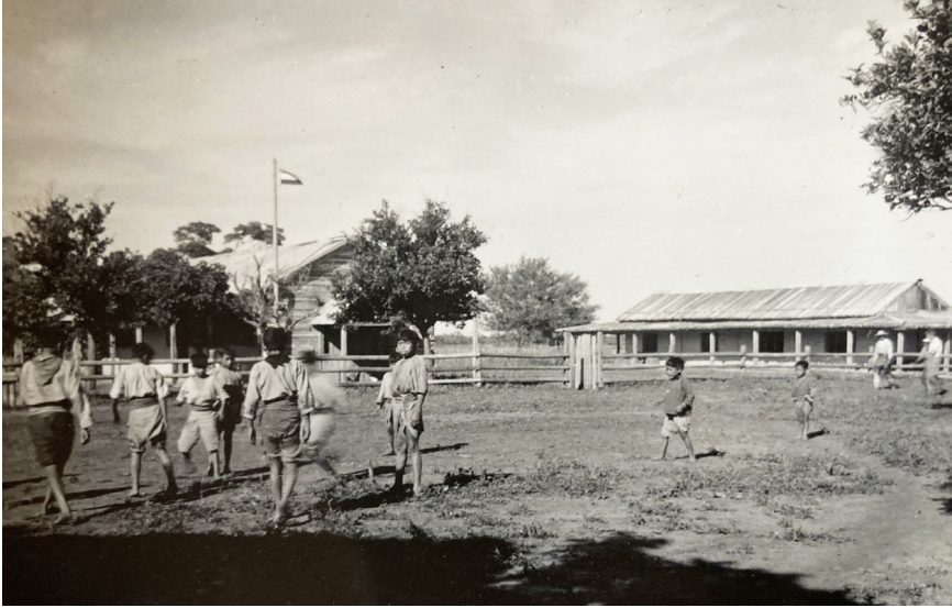
FIGURE 2. Enxet children playing in front of the church at Makxawáya circa 1938. The Paraguayan flag flies atop the steeple.

efforts provide some of the most detailed written accounts of the initial colonization process. In his writings, Grubb makes clear the rationale for the Bajo Chaco mission: “The South American Missionary Society gave instructions to their men, not only to enter into and dwell in their [i.e., Enxet] land, whatever the risk, but to attempt no less a task than that of opening up this unknown land, of revolutionizing the native customs, habits, modes of life, and laws.” 29 By “opening up” the Bajo Chaco, Grubb’s missionary work also served as a surrogate for state territoriality. Pictures from the era show that Anglican churches built in the Bajo Chaco provided a space to worship and pledge allegiance to Paraguay, where the nation’s dual images—the Christian cross and Paraguayan flag—were often displayed side by side. Given that the Paraguayan state had no presence in the Chaco before the arrival of the Anglicans, the Mission helped establish a new order of social and spatial relations along the country’s western frontier. 30 As a result, Paraguayan officials named Grubb Comisario General del Chaco y Pacificador de los Indios —the Chaco’s Justice of the Peace and Pacifier of the Indians.