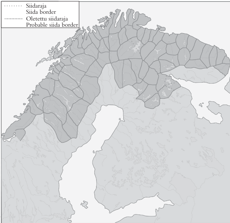
Figure 9.1: Lapp villages in northern Fennoscandia