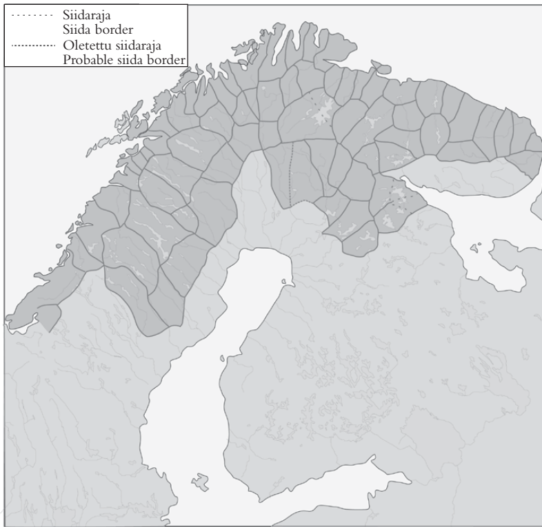
Figure 9.1: Lapp villages in northern Fennoscandia

Source: Map by Johanna Roto (2005); reproduced with permission