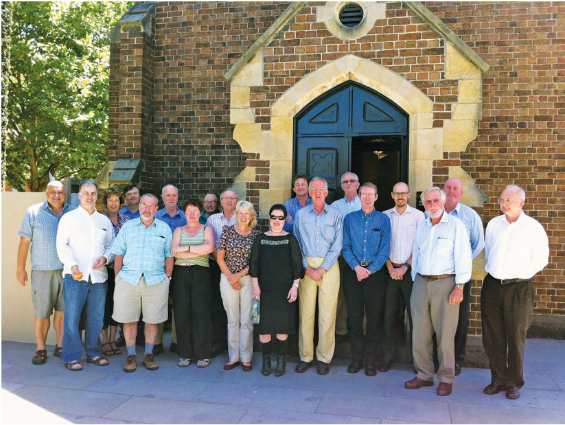
Figure 5: Participants at the second workshop for the Cambridge Economic History of Australia , Trinity College, University of Melbourne, February 2013