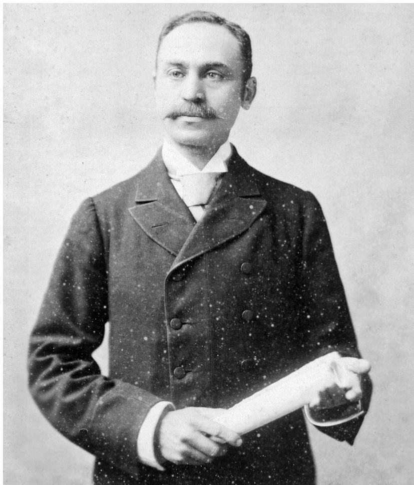
Figure 1: Timothy Augustine Coghlan, early twentieth century

international reputation for quality and objective statistics. 12 Others then used these statistics to develop political arguments regarding their view of Australia's destiny. 13 Although not historians themselves (they were too engrossed in 'progress' to turn their lens backwards), this generation of 'statistician-participant-observers' developed the quantitative foundation on which historical analysis was built. 14