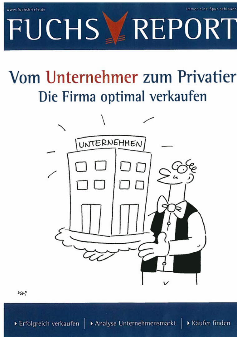
Figure 2 “From entrepreneur to rentier”

As ownership transfer turns into an entrepreneurial opportunity, the new owners are similarly placed in an entrepreneurial context. Buying a business is thereby perceived as a form of founding in no way inferior to starting a business. The boundaries between these two forms of entrepreneurship are blurred. For example, a recent brochure by the next initiative reads “No matter if you found a new business or take over an existing one [...] you are a founder.” With no differentiation made between these two categories, new business owners also appear more willing, credible, and competent than before. The transfer of ownership has now completely lost its attachment to the family and its continuity; in its place steps a strict focus on business continuity, with transfer being an entrepreneurial milestone in managing and building a healthy business.