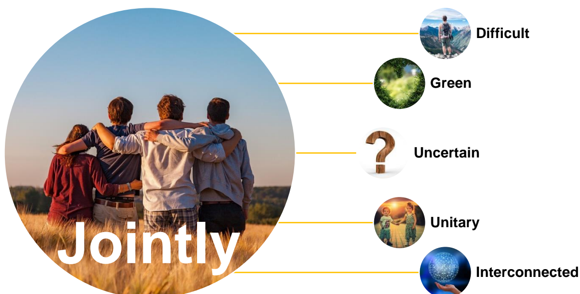
Figure 3. How do young people in Romania see the future of the European Union?

Source: young participants in the EUROPE DIRECT Bucharest events (2021 and 2022)