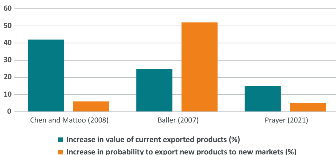
FIGURE 1: THE ECONOMIC IMPACT OF MRAs ON TRADE FLOWS