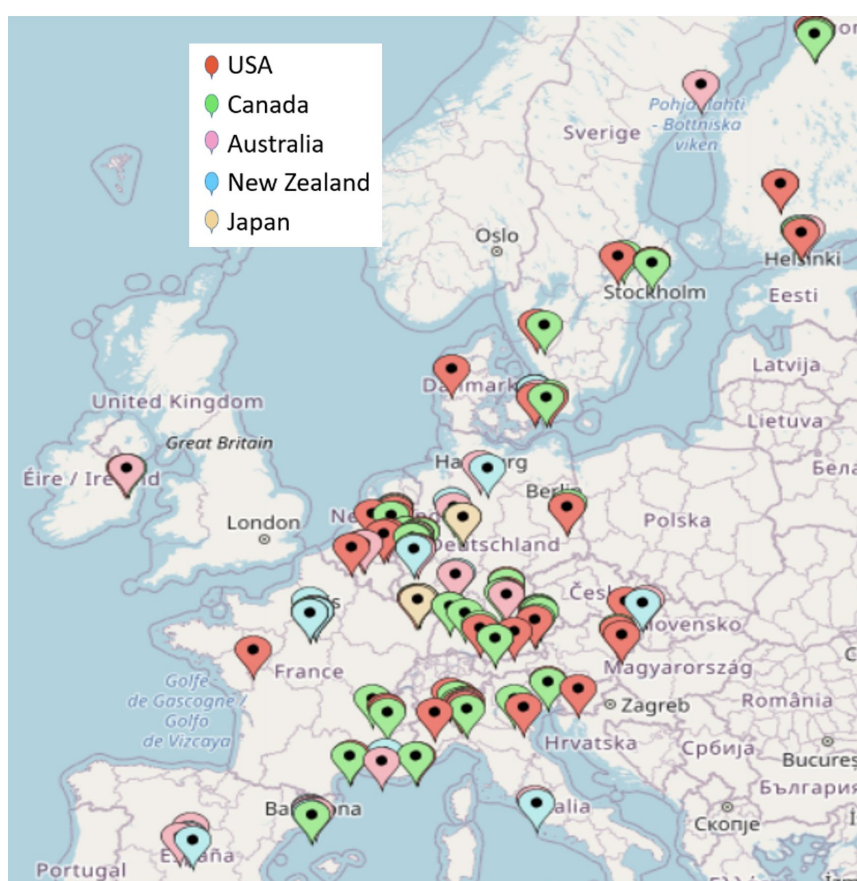
FIGURE 2: EU CONFORMITY ASSESSMENT BODIES ACCREDITED UNDER VARIOUS EU MRAs