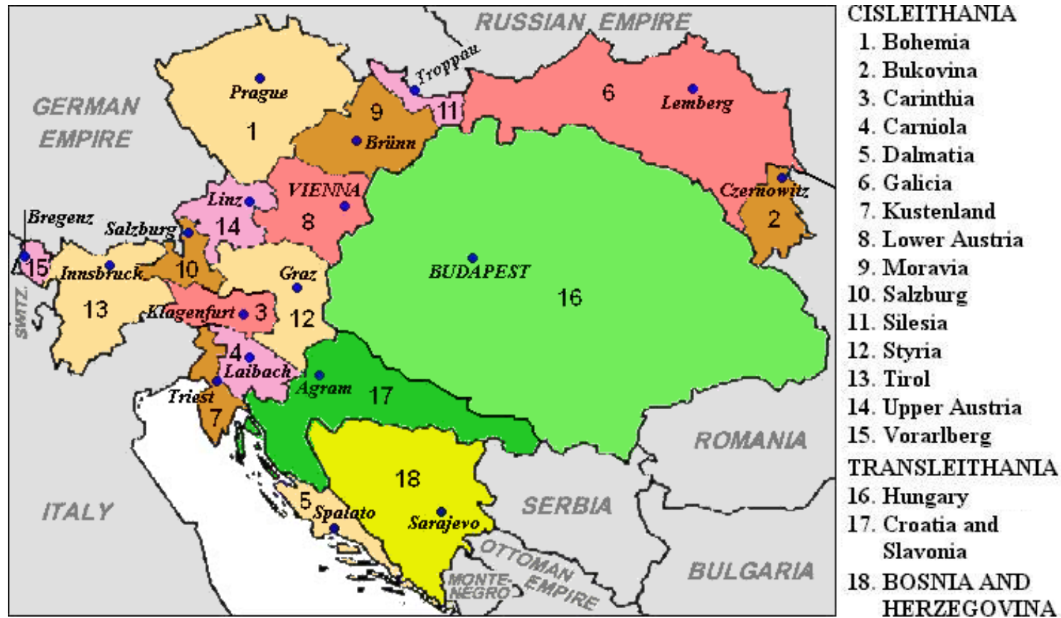
Map1: the provinces and province-capitals of the Habsburg Empire prior to 1914