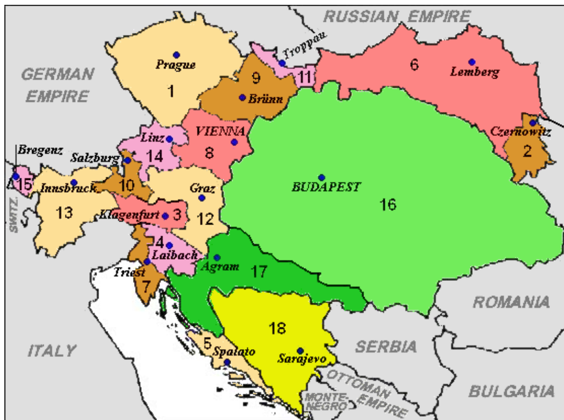
Map1: the provinces and province-capitals of the Habsburg Empire prior to 1914