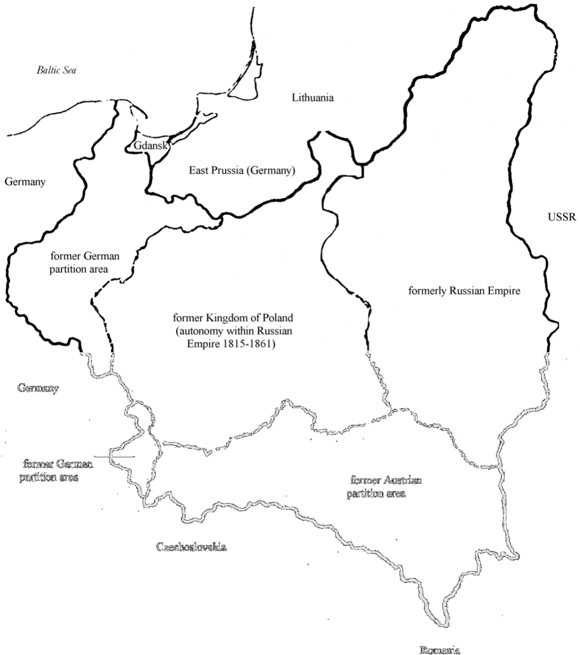
Map 1: Poland as in 1921 and the former partition borders

Based on Rocznik Statystyczny 1928, Warsaw (1929).