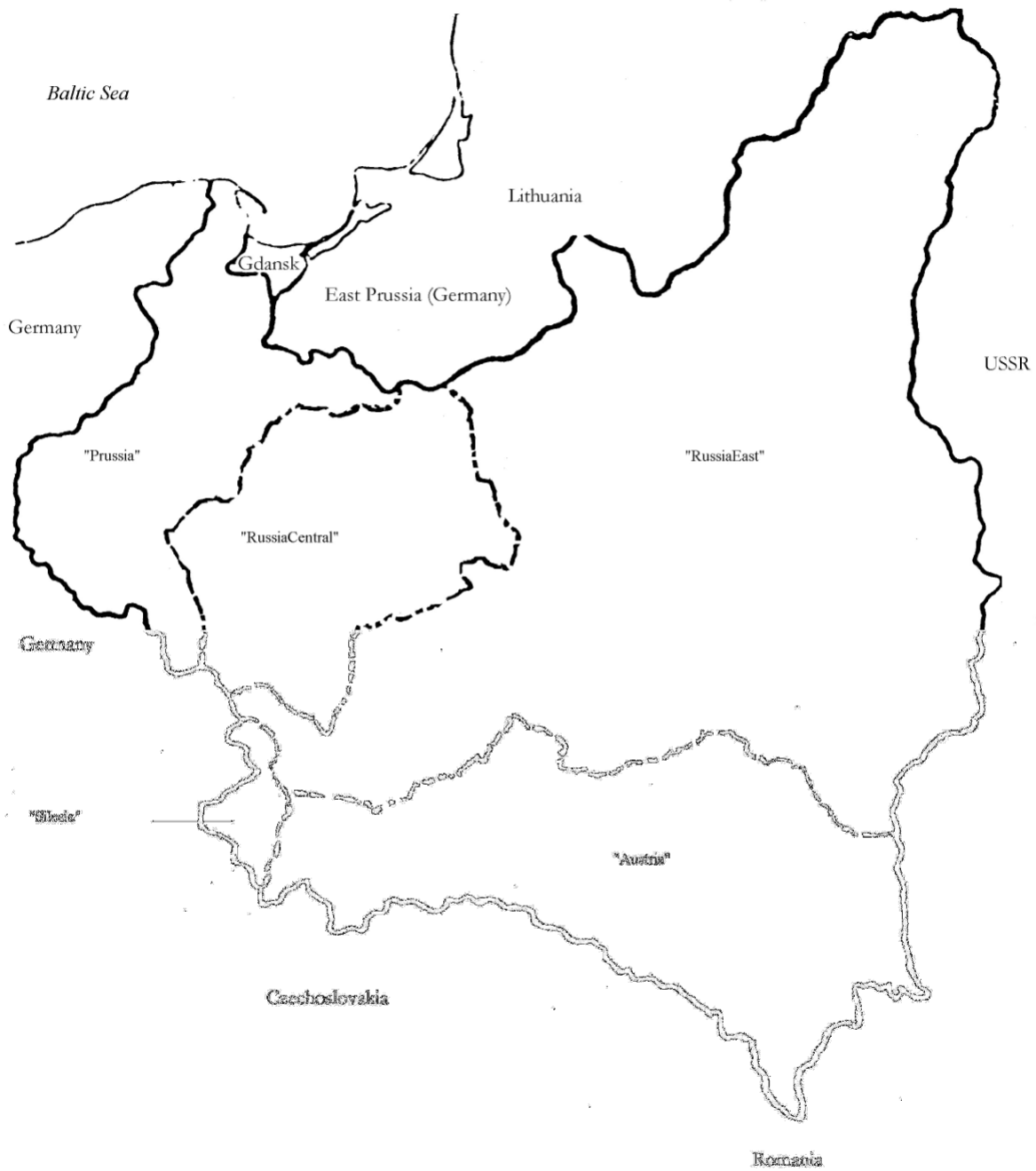
Map 3: Defining Five Big Areas

Based on Rocznik Statystyczny 1928, Warsaw (1929).