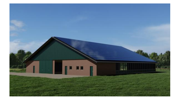
Figure 4. Dairy barn with rooftop solar panels

Picture source: Nina Klaucke (Landscape architect) and Angelika Dauermann