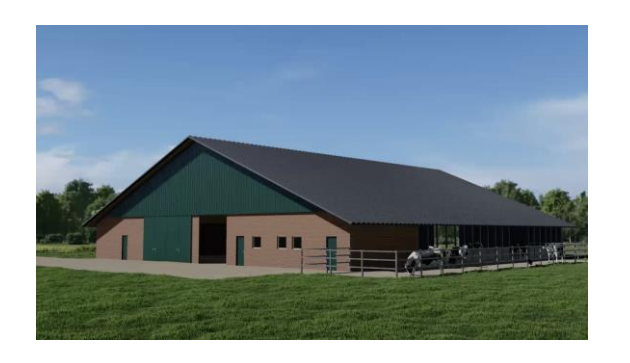
Figure 3. Dairy barn with outdoor cattle pen and visible dairy cattle

Picture source: Nina Klaucke (Landscape architect) and Angelika Dauermann