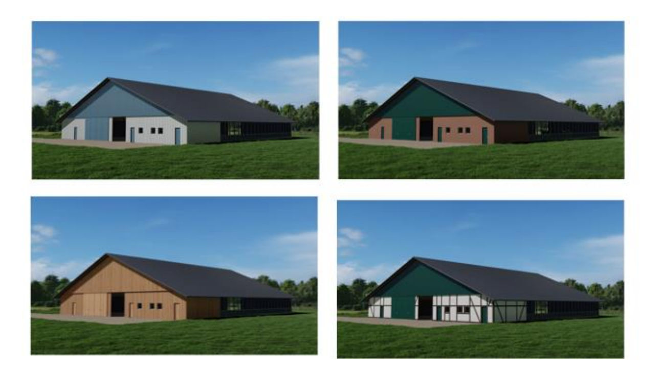
Figure 1. Various materials and different colored façades used for the exterior of the barns (gray-blue trapezoidal sheet metal façade, wooden façade, red clinker brick façade, white half-timbered façade)

Photographic images of existing dairy barns could not be used because factors that might affect the perceptions of the interviewees – such as weather or individual yard space design – cannot be standardized. This was crucial for the focus to remain on how the interviewees perceived factors of the dairy barn design that had deliberately been changed. The study examines the effect of different barn façade material and façade colors (wooden façade, trapezoidal sheet façade) as well as of dairy barn exteriors that tie in with the historical architectural style of the Osnabrück region in particular (white half-timbering) or of northwestern Germany (clinker brick façade) (see Figure 1 below). We also analyzed the effect of different types of greening (hedges, loosely grouped trees) (see Figure 2), cows visible in the pen (see Figure 3) as well as a dairy barn with solar panels on the roof (see Figure 4).