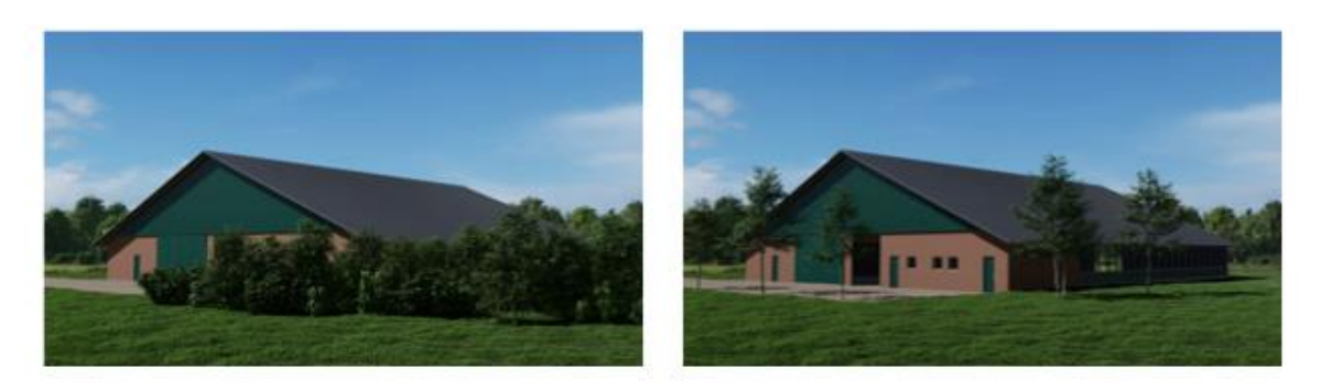
Figure 2. Types of greening – hedges and loosely grouped trees