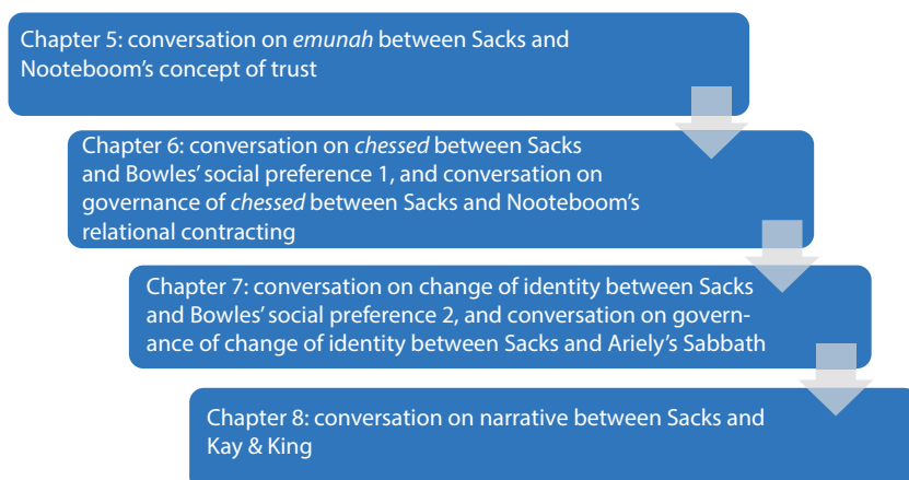
Figure 5.1 Thematic structure of the transversal reasoning

Each turn within TR consists of two parts.