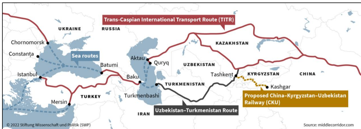
Fig. 3: The Middle Corridor of BRI

In contrast to its rising economic importance in the South Caucasus China was avoiding open conflicts with the other powers in the Region – Russia and the West. For instance, during the Nagorno-Karabakh War in 2020 China was an invisible actor, only. Azerbaijani planes made over 100 flights to China and back with alleged humanitarian aid to Baku. At that time the most other countries were trying to maintain their neutrality. Therefore, it can be assumed that China was interested in an Azerbaijani victory because it would open the corridor between Azerbaijan and Nakhichevan, the Zangezur corridor. (Toroyan 2023) That would open up new transport opportunities between China and Europe via the South Caucasus. Today, after the final victory of Azerbaijan in Nagorno-Karabakh this vision may become reality soon. Additionally, Russia's role as security guarantor in the South Caucasus till September 2023 left China in a comfortable position. The People's Republic welcomed Russian interventions like in Nagorno-Karabakh. As consequence, China didn't have to get its own hands dirty, and could continue to roll out the Belt and Road Initiative. (Biscop 2023, 8)