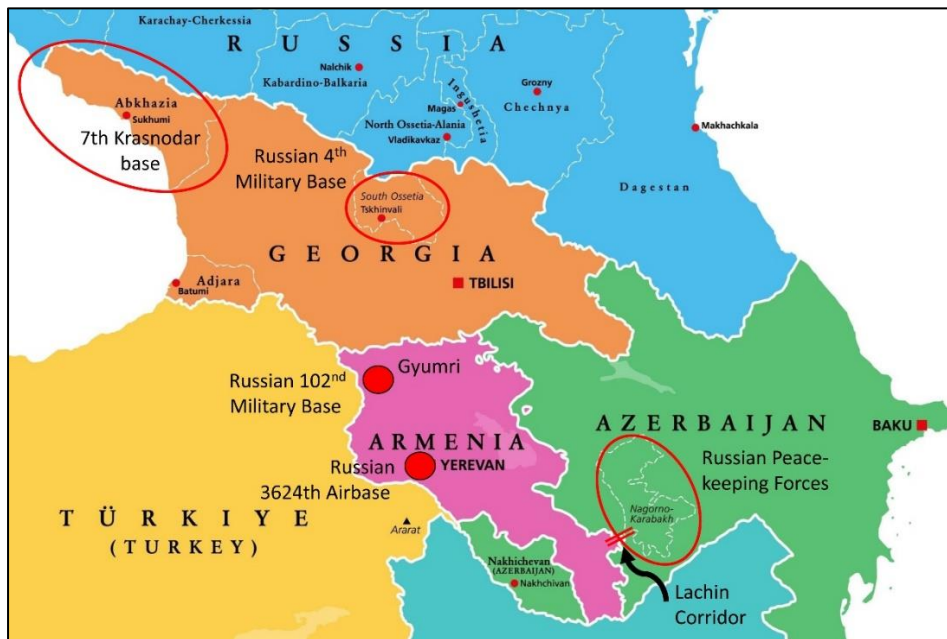
Fig. 2: Russian Armed Forces in the South Caucasus (till 2023)