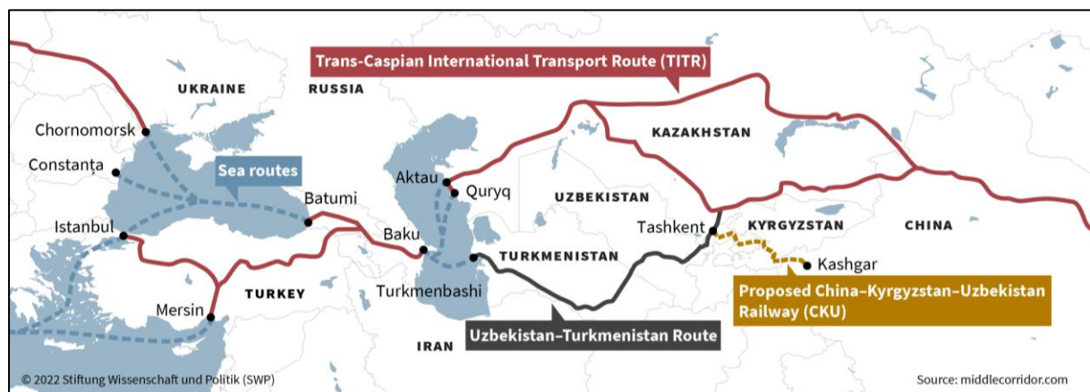
Fig. 3: The Middle Corridor of BRI

In contrast to its rising economic importance in the South Caucasus China was avoiding open conflicts with the other powers in the Region – Russia and the West. For instance, during the Nagorno-Karabakh War in 2020 China was an invisible actor, only. Azerbaijani planes made over 100 flights to China and back with alleged humanitarian aid to Baku. At that time the most other countries were trying to maintain their neutrality. Therefore, it can be assumed that China was interested in an Azerbaijani victory because it would open the corridor between Azerbaijan and Nakhichevan, the Zangezur corridor. (Toroyan 2023) That would open up new transport opportunities between China and Europe via the South Caucasus. Today, after the final victory of Azerbaijan in Nagorno-Karabakh this vision may become reality soon. Additionally, Russia's role as security guarantor in the South Caucasus till September 2023 left China in a comfortable position. The People's Republic welcomed Russian interventions like in Nagorno-Karabakh. As consequence, China didn't have to get its own hands dirty, and could continue to roll out the Belt and Road Initiative. (Biscop 2023, 8)