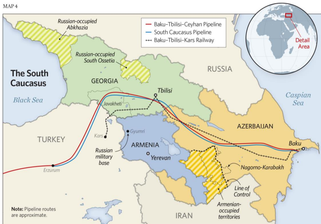
Fig. 1: The South Caucasus’ Conflict Zones (till 2023)

Sources: Heritage Foundation research based on information from Radio Free Europe/Radio Liberty, “Leaders Discuss Nagorno-Karabakh Conflict; Kerry Expresses ‘Strong Concern,’” September 5, 2014, http://www.rferl.org/content/nagorno-karabakh-/26567727.html (accessed January 5, 2015), and SOCAR Romania, “The Global Scale of the State Oil Company of Azerbaijan Republic,” http://www.socar.ro/en/SOCAR-AZERBAIJAN (accessed January 5, 2015).