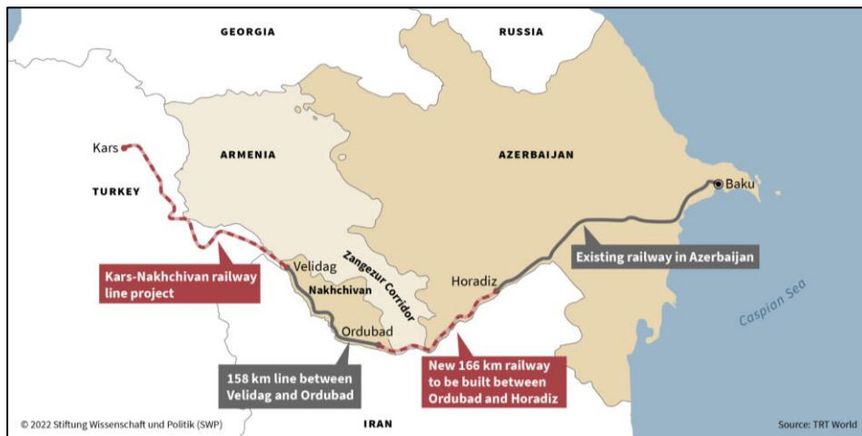
Fig. 4: Zangezur Corridor in the South Caucasus