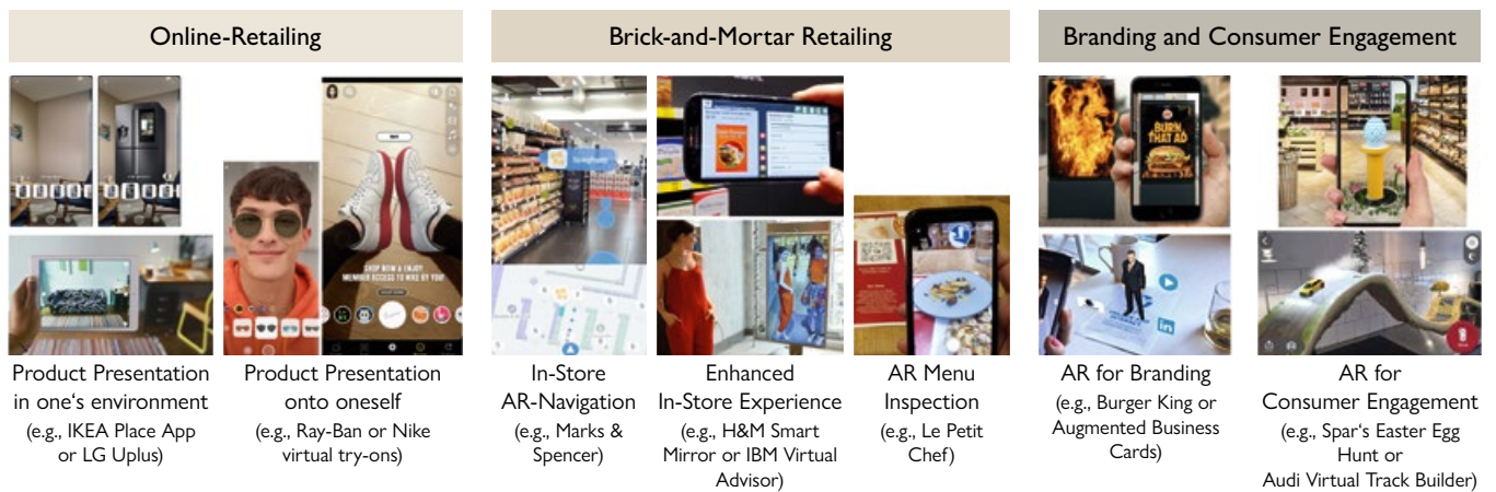
Figure 2: Augmented Reality Applications for Marketing and Sales