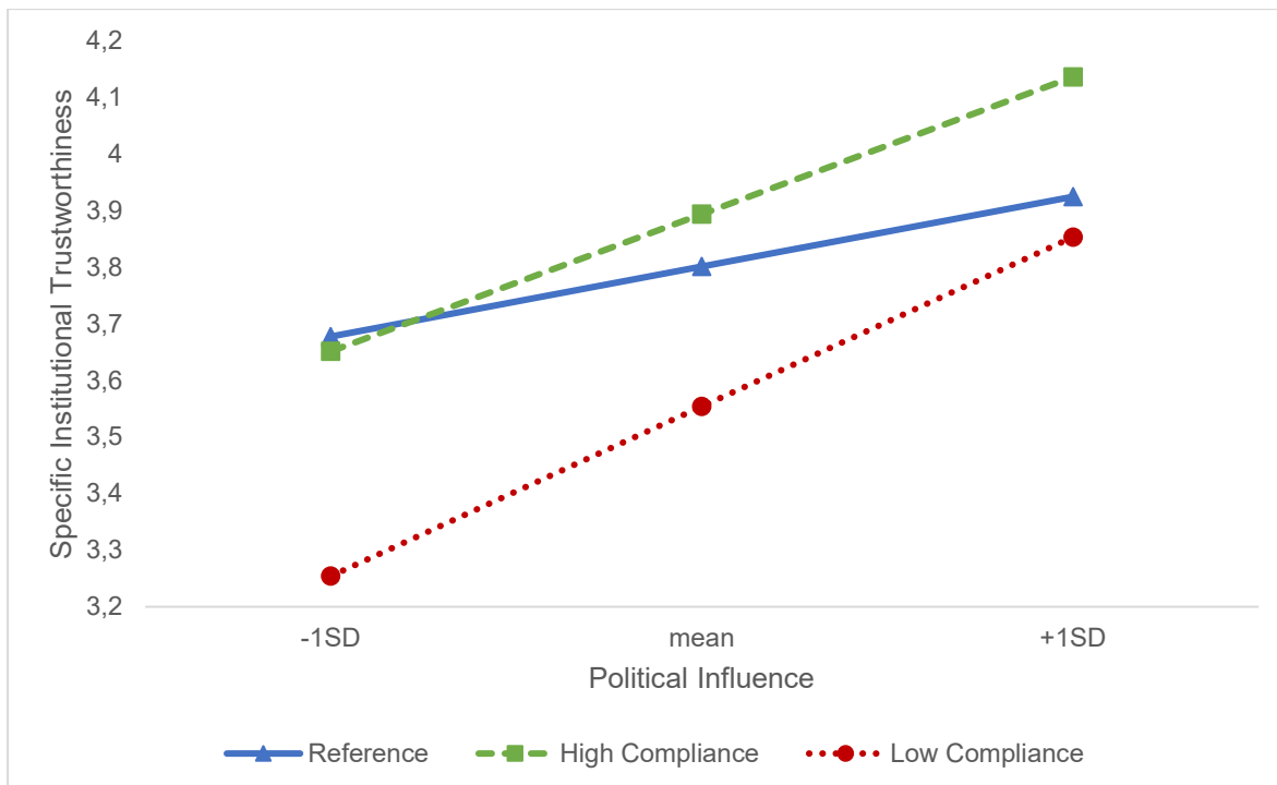
Figure 3: Values of specific institutional trustworthiness scale in the experimental conditions at three levels of the political influence scale (SD = Standard Deviation).