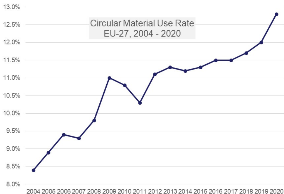
Figure 2: Circular Material Use Rate

The circular material use rate reported in Figure 2 measures the share of recycled materials in total inputs. 5 Aggregate domestic material consumption is obtained from economy-wide material flow accounts and is corrected for imports and exports of waste. A higher circularity rate means that more secondary materials substitute for primary raw materials, thereby saving natural resources and reducing the adverse environmental impact from extraction of natural resources. Recycled materials are becoming increasingly important in final goods production. Between 2004 and 2020, their share in total material use has grown by more than 50 percent, from 8.4 to over 12.8 percent in 2020.