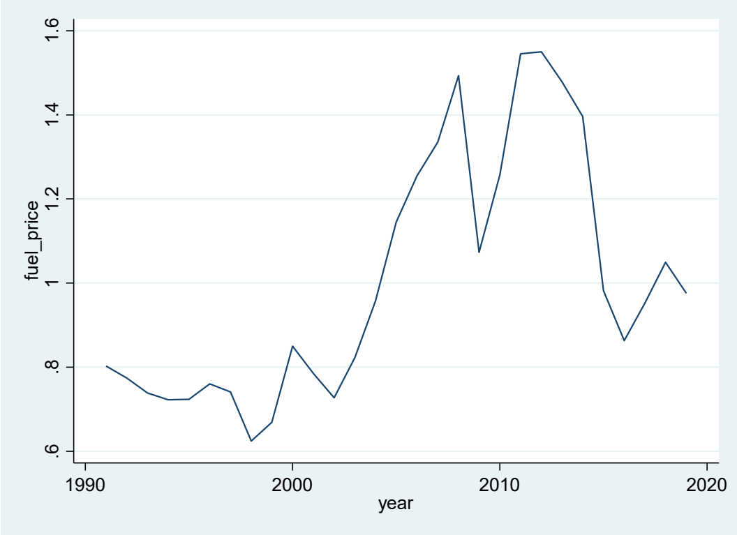
Figure 3: Real Aviation Fuel Price by Year