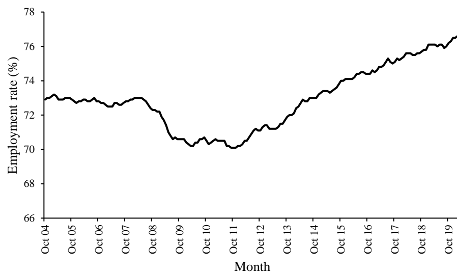
Figure 1: UK employment rate, 2004-2020

Source: Office for National Statistics, Labour Force Survey.