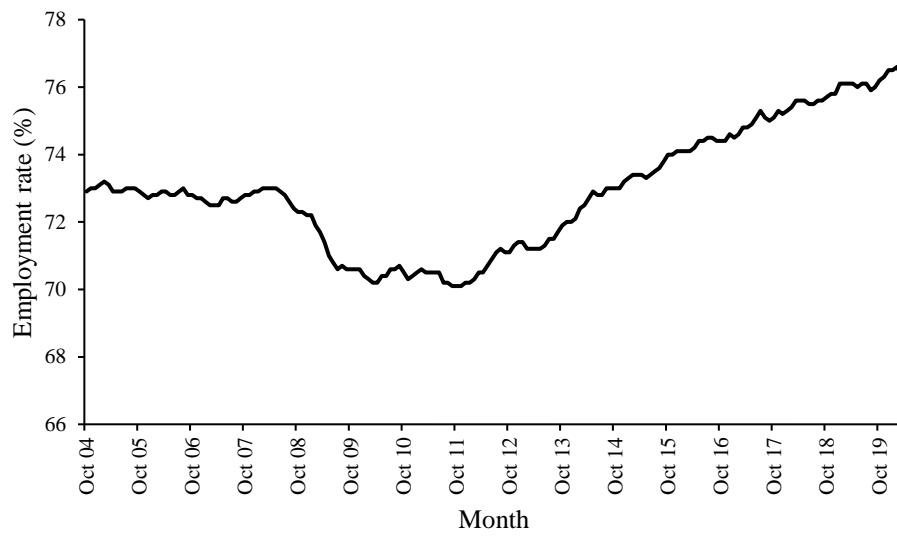
Figure 1: UK employment rate, 2004-2020

Source: Office for National Statistics, Labour Force Survey.