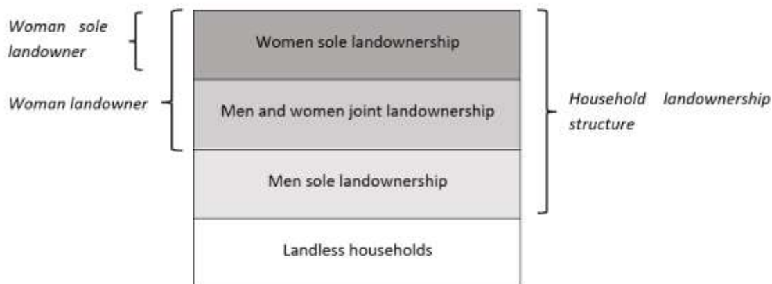
Figure 1. Household structure of land ownership by gender

For preliminary insights, we create the dummy variable "Woman landowner," taking a value of 1 if there is at least one woman in the household who solely owns or jointly owns land with a man (0 otherwise). To further understand the role of women's land ownership, we distinguish between "Woman sole landowner" and "Man sole landowner."