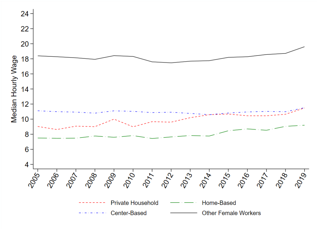
Figure A1: Median Hourly Wages of Child Care Workers, by Sector, 2005-2019

Source: American Community Survey from 2005 to 2019. Notes: The term “Private Household” refers to private household child care providers, defined as those employed in the private household services industry and whose primary occupation is a child care worker. The term “Home-Based” refers to workers who are self-employed in the child day care services industry and whose occupation is a child care worker or education administrator. The term “Other Female Workers” refers to women employed in all other (non-child care) industries. All figures are adjusted for inflation to reflect 2019 dollars.