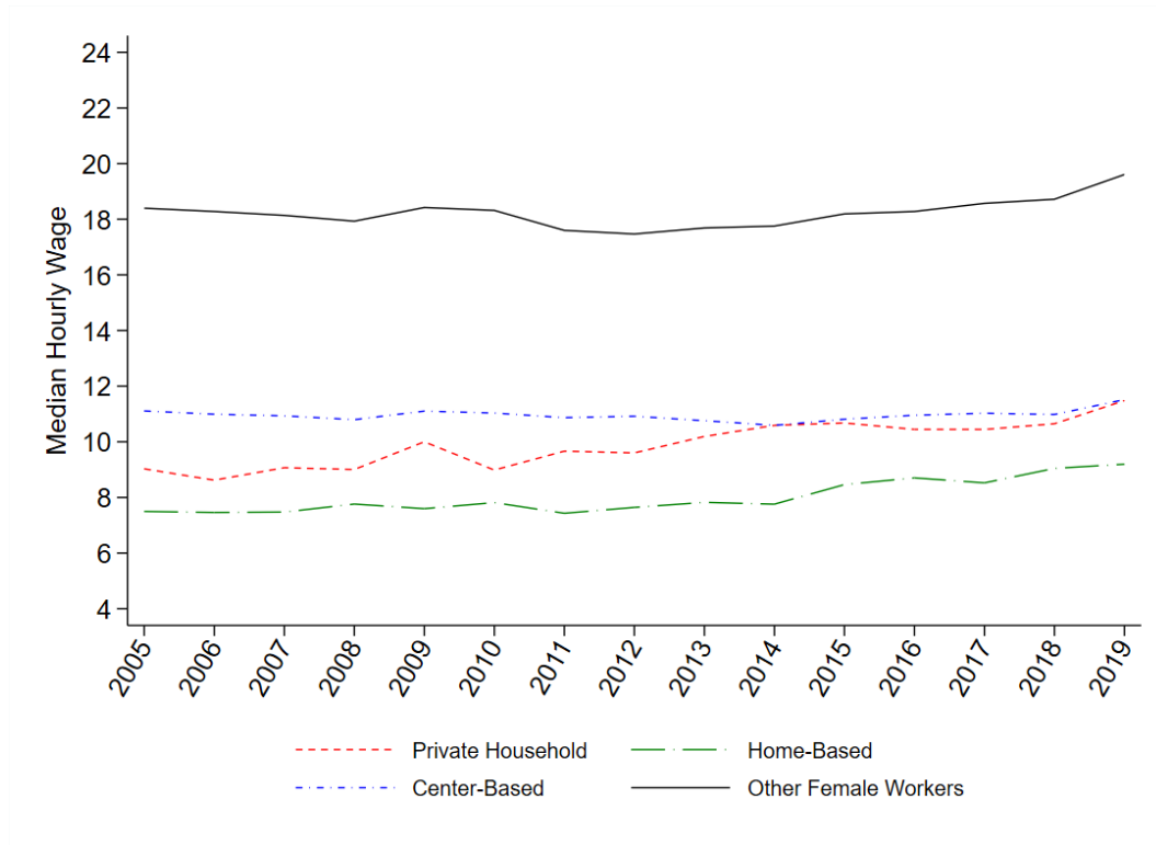
Figure A1: Median Hourly Wages of Child Care Workers, by Sector, 2005-2019

Source: American Community Survey from 2005 to 2019.