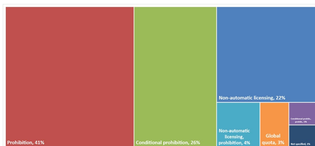
Chart 1 Export restrictions on COVID-19 related products, by Type of Measure (Percentage)