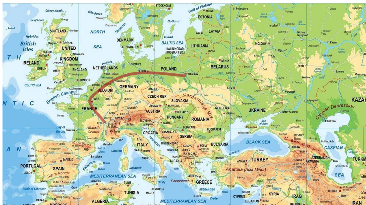
Figure 1 / The core of a northern route of the ‘European Silk Road’ high-speed rail network