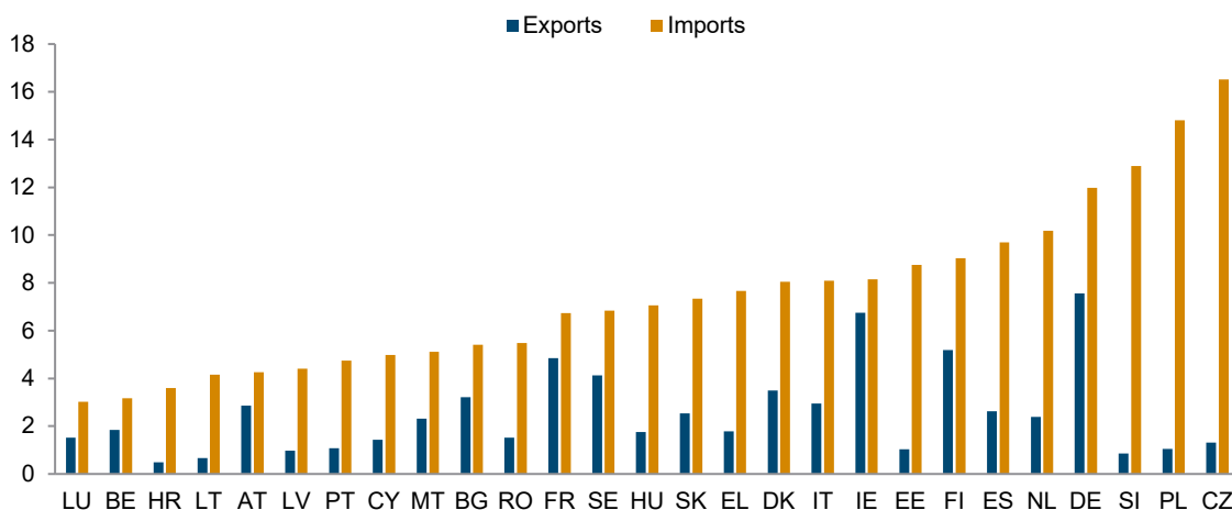
Figure 1 / Shares of China in merchandise exports and imports in 2021, %

Economic relations between the EU and the People's Republic of China have been steadily developing. The country has become the EU's third-largest export destination and its largest source of imports. In 2021 China accounted for 8.3% of extra-EU merchandise exports and 16.6% of extra-EU merchandise imports, up from 2.8% and 6.4% respectively in 2002. Member states' trade relations with China are very diverse (see Figure 1), with Czechia, Poland, Slovenia and Germany having the heaviest reliance on China as a source of imports – it accounted for, respectively, 16.5%, 14.8%, 12.9% and 12% of their total (including intra-EU) merchandise imports in 2021. For Germany, China accounts for the highest share of merchandise exports among the EU member states – 7.6% in 2021. Austria is less dependent than most other EU members on Chinese trade – China's share in 2021 was only 2.9% of Austria's exports and 4.3% of its imports.