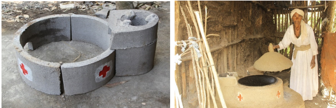
Figure B2. The Mirt stove as produced by the Ethiopian Red Cross Society (ERCS).