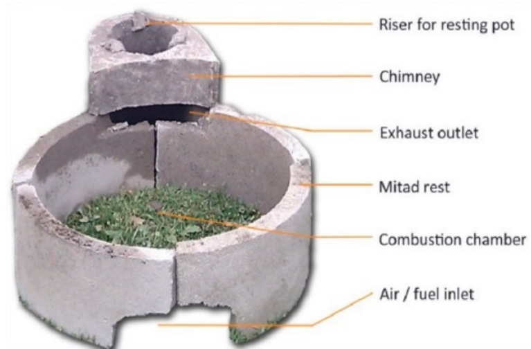
Figure B1. The Mirt stove design.