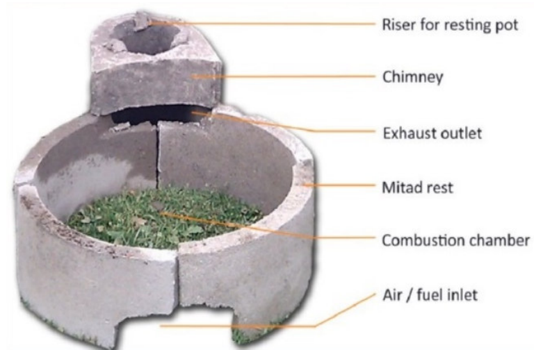
Figure B1. The Mirt stove design.