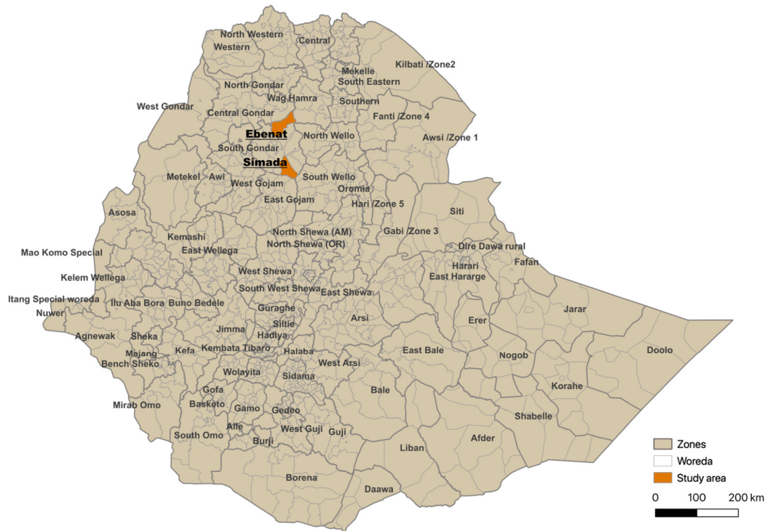
Figure A1. Map of study area in Ethiopia