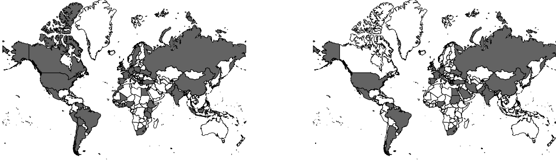
(a) Surveyed countries