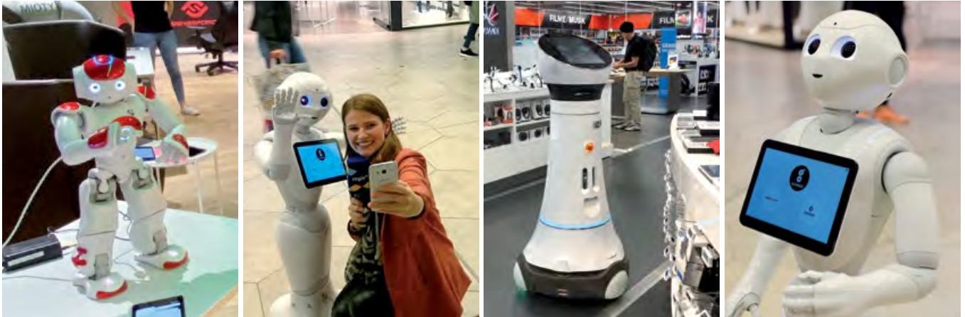
Figure 1: Service Robots in Different Retail Sectors