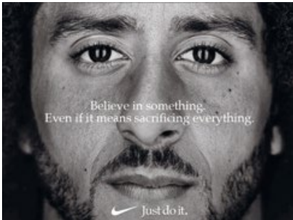
Nike: ad campaign featuring Colin Kaepernick.