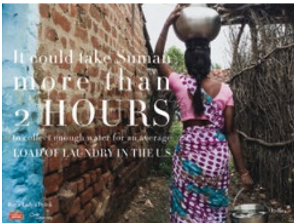
Stella Artois: Addressing the global water crisis, this ad refers to Westerners’ disproportionate water consumption, potentially inducing self-critical feelings.

sons other than the judge or agent” (Haidt, 2003, p. 853). In his pioneering work, Haidt (2003) describes moral emotions as disinterested, pointing out that these emotions can be triggered even without a direct personal stake in the topic. As a second prototypical feature of moral emotions he identifies prosocial action tendencies, such as donating to a cause. Depending on the focus (self vs. other) and the valence of the moral emotions, four distinct clusters of emotions are derived: self-conscious, other-praising, other-condemning, and other-suffering emotions.