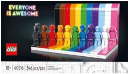
LEGO® “Everyone is Awesome”: the brand openly promotes equality, inclusion, and diversity.