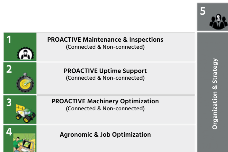
Fig. 3: FarmSight Services 4+1 Focus Areas