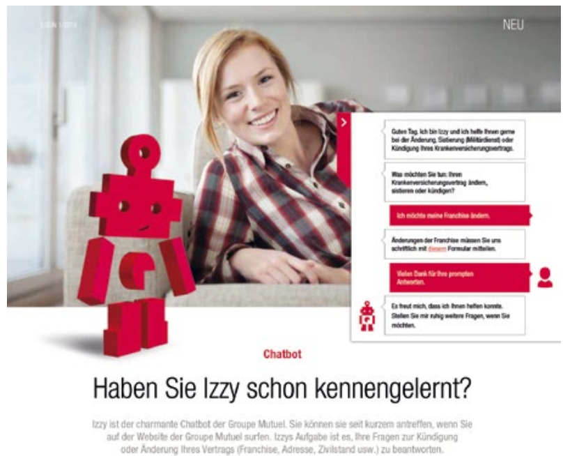
Figure 2: Chatbot Izzy Introduced in Groupe Mutuel’s Customer Magazine

In October 2017, the Swiss insurer Groupe Mutuel added a French- and German-speaking chatbot to its customer portal to serve its more than 1.2 million health plan members (Groupe Mutuel, 2018). The chatbot, named “Izzy”, was developed in just one month. Izzy guides clients through changes or cancellations of their health insurance contracts – high-volume, business-critical transactions. For example, Izzy will provide the customer form required to change the address of a contract or walk a customer through suspending a contract due to military service. Groupe Mutuel focused on these use cases because they are straightforward and easy to automate yet demand much of the call center agents’ time. At Izzy’s launch, Groupe Mutuel successfully set