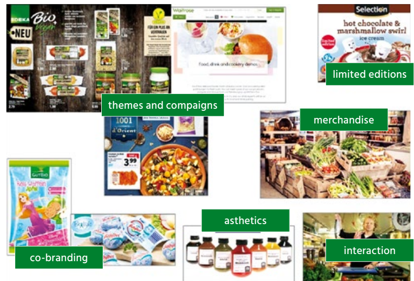
Fig. 3: Examples of Experiential Design in Regard to Assortment in the Food Retail Industry