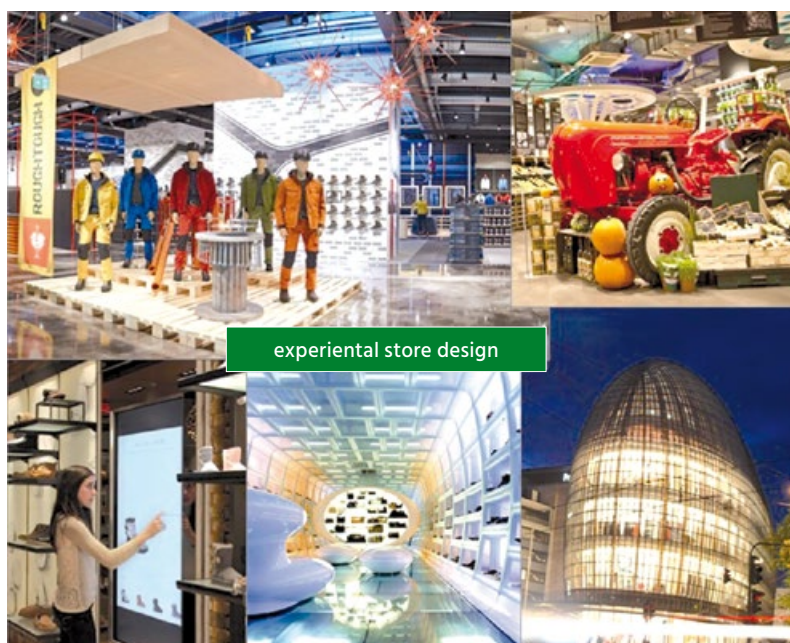
Fig. 4: Store Design to Create Retail Experiences

In this paper a three-layer-framework for experience design in retailing was derived. The layers included are the store brand (retailer as brand), private labels and point-of-purchase communications. Though reductive, the layer model might be used for systematic analysis of retail situations and can help to consistently design relevant experiences. Spotlighting physical retail settings and drawing on a given definition of retail experience, the paper's ideas, however, are not to apply to a comprehensive framework for total customer experience. Measurement issues were not discussed and implications for online retailing were not examined, neither.