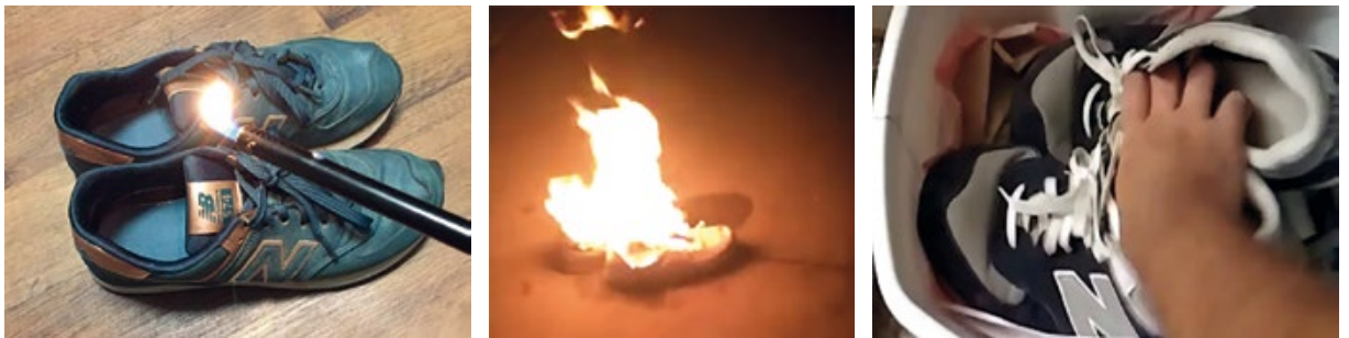
Figure 3: New Balance brand disruption