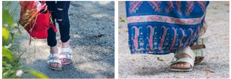
Figure 2: Birkenstock sandals

Interestingly, the Birkenstock case was also substantiated by the phenomenological interviews. Participants expe-