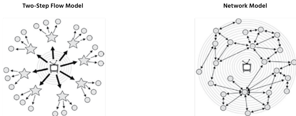
Figure 1: Models of Influence

To pursue the research objective two brand disruption cases, namely of Birkenstock and New Balance, were qualitatively analysed and compared. First, both brands were subject to an explorative netnography. As Kozinets (2002) describes, netnography is the transfer of ethnographic procedures to the internet. Thus, brand-related consumption practices were studied online, in-depth, and prolonged. Muniz and O’Guinn (2001) highlight the web as a capable source to explore consumers’ behaviour, their value systems, and their relationships to objects. Birkenstock and New Balance were traced within newsgroups, online forums (e.g. www.dasneuebirkenstockforum.eu, www.sizetag.de) and social media channels (e.g. www.facebook.com, www.instagram.com). Second, to enrich online data phenomenological interviews