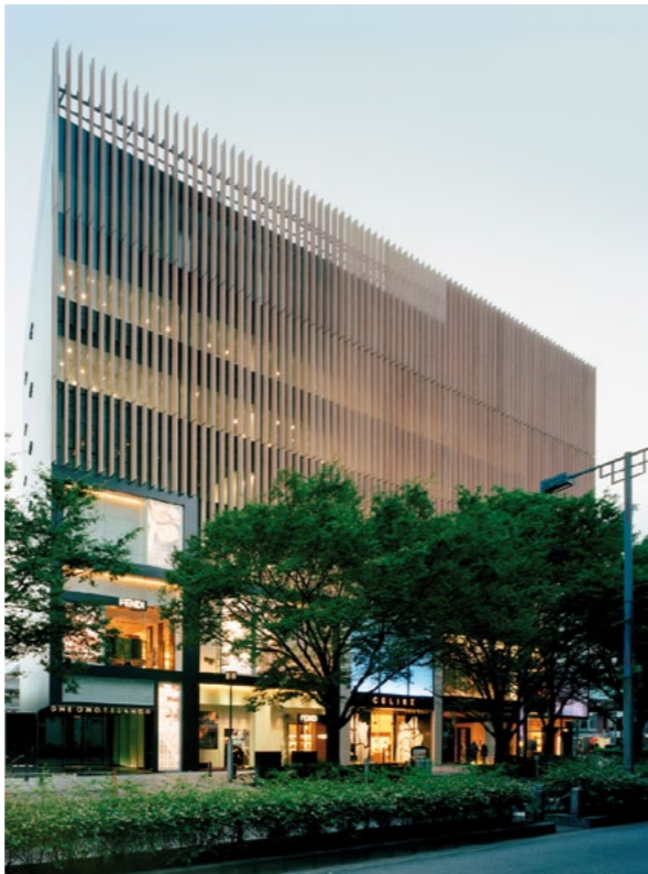
Omotesando, Tokyo where there are many freestanding stores selling luxury products

It is estimated that 70% to 80% of sales of luxury products in Japan take place at department stores. Therefore, depart-