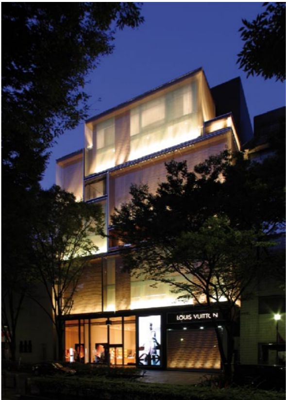
Flagship store of Louis Vuitton in Omote-sando, Tokyo

Some customers buy luxury products at freestanding stores, others buy them at shop-in-shop stores in department stores. Because Luxury products are generally expensive, it is often the case that customers assess the products beforehand. However, they do not necessarily look at the products at the store they make their purchases at.