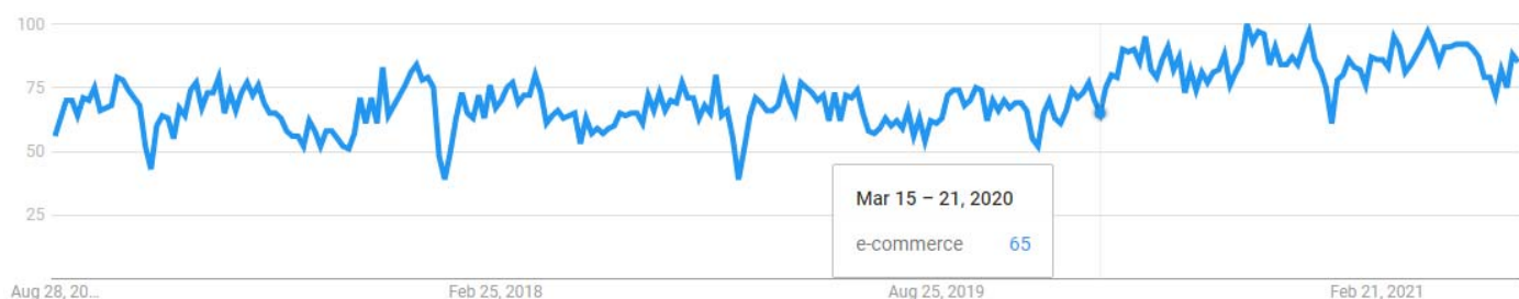
Figure 2. Google trends worldwide interest for the “e-commerce” keyword in the August 2016–August 2021 period for all categories of search.

Similarly, the interest in “e-commerce” has grown starting March 2020, as available in Figure 2. The “e-commerce” keyword registered a significantly higher search volume in March 2020–August 2021 compared with the August 2016–March 2020 period, t(258) = -17.3, p < 0.001 .