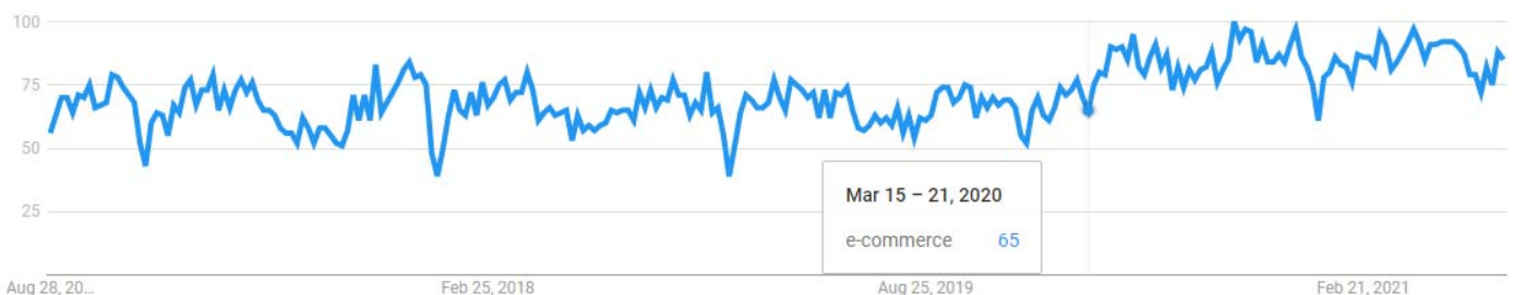
Figure 2. Google trends worldwide interest for the “e-commerce” keyword in the August 2016–August 2021 period for all categories of search.

Similarly, the interest in “e-commerce” has grown starting March 2020, as available in Figure 2. The “e-commerce” keyword registered a significantly higher search volume in March 2020–August 2021 compared with the August 2016–March 2020 period, t(258) = -17.3, p < 0.001 .