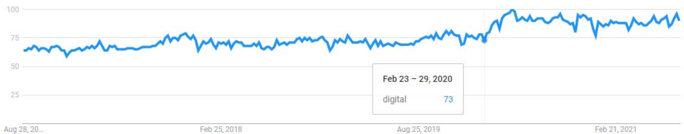
Figure 1. Google trends worldwide interest for the “digital” keyword in the August 2016–August 2021 period for all categories of search.

Contrary to the general fear that the COVID-19 pandemic would generate a decrease in spending (Anderson 2021), it increased sales, especially in e-commerce (UNCTAD 2021; Statista 2021c). The interest for “digital” has grown starting March 2020, as presented in Figure 1, for all the categories of search worldwide. The “digital” keyword registered a significantly higher search volume in March 2020–August 2021 compared with the August 2016–March 2020 period, t(258) = -33.2, p < 0.001 .