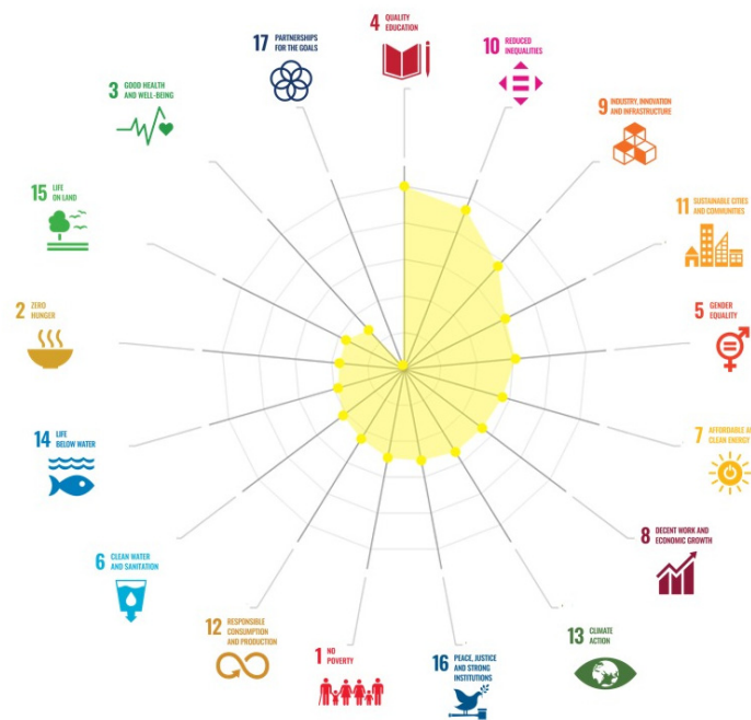
Figure 2. Radar graph of disclosed SDGs.

Regarding the SDGs disclosure, Figure 2 provides an overview of the disclosed goals. Specifically, an analysis of the 29 revealed how the most disclosed SDG is goal 4, “Quality education”, which was reported by 72% of the entire sample of HEIs. The second most relevant goal is SDG 10, “Reduced inequalities”, with a similar value (68%). In third place is goal 9, “Industry, innovation, and infrastructure”, which was disclosed by 55% of the sample.