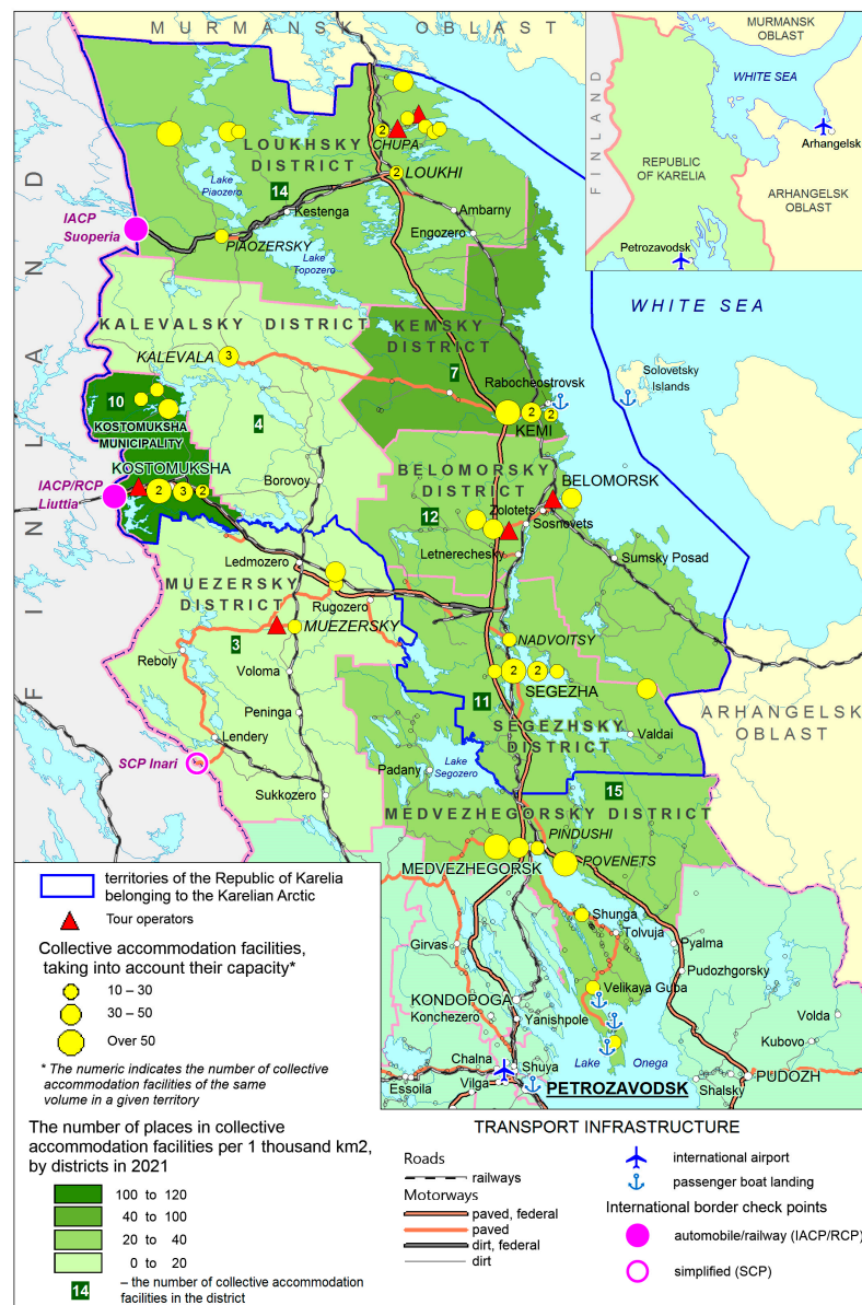
Figure 1. Infrastructure of the tourist and recreational system of the Karelian Arctic and economically related regions.

Despite certain lack of infrastructure, the geographical location of the Karelian Arctic itself is a potential advantage. The territory is accessible to all the most popular modes of transport and is in close proximity to such large agglomerations as St. Petersburg and Moscow. In addition to transport connectivity with the agglomerations, the territory of the Karelian Arctic is provided with communication routes with the neighboring Arkhangelsk region and Finland. The advantages of the border position of the territory are currently debatable. Some risks thematically related to the subject of the study will be disclosed in the work further down the text. In addition to geographical wishes, the strength of the studied territories is its recreational attractiveness in terms of the concentration of various types of tourist resources.