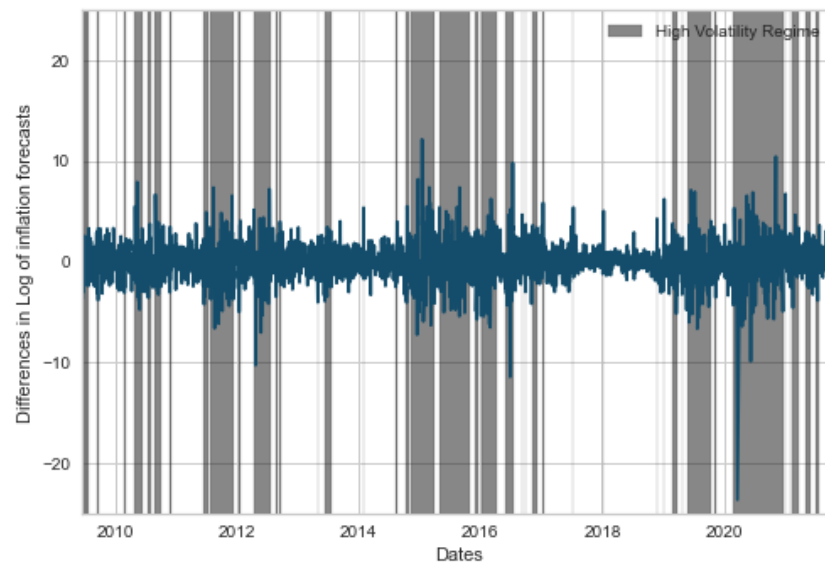
Figure 1. Implied inflation changes through volatility regimes.