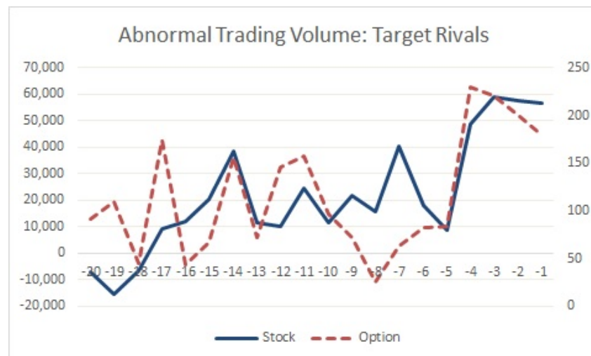
Figure 4. Stock and Option represent the average daily abnormal trading volume of the stocks and options over the 20-day period prior to the announcement for target rivals, respectively.

Then I report the cumulative abnormal trading volumes of the stocks and options over the 20-day pre-announcement period averaged across all the merging firm rivals in Table 5. Option results are reported by option type and moneyness group. We can see that both acquirer rivals and target rivals experience significant abnormal trading volumes in the stock market. Acquirer rivals experience significant abnormal trading activities in both ATM and OTM option groups, while target rivals see a higher abnormal volume in the ATM group. Again, when the average number of rivals each merging firm has is taken into account, these abnormal option trading activities pertaining to the rival firms are considerable.