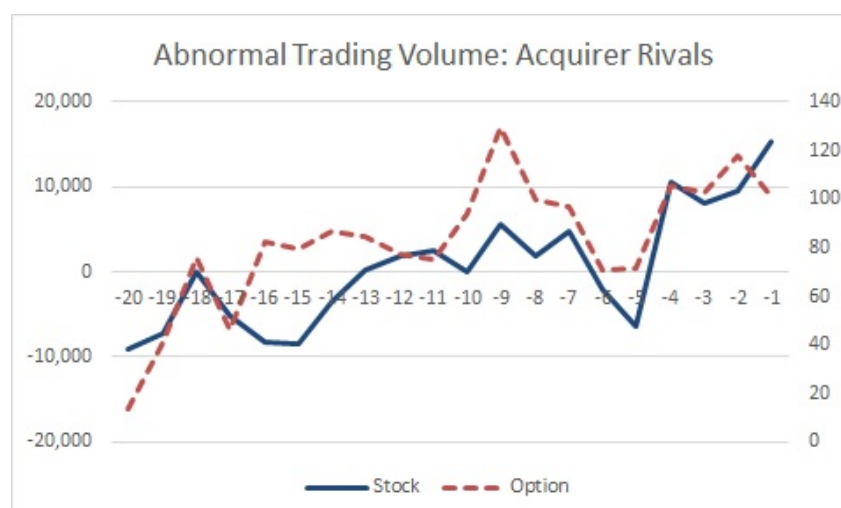
Figure 3. Stock and Option represent the average daily abnormal trading volume of the stocks and options over the 20-day period prior to the announcement for acquirer rivals, respectively.

In this subsection, I present how the average abnormal trading volumes evolve over the 20-day period prior to M&A announcements for acquirer rivals and target rivals, respectively. As shown in Figures 3 and 4, the trend of increasing abnormal volume for both acquirer and target rivals is, although slow and somewhat volatile, notable. For acquirer rivals, the average daily abnormal trading volume rises to 15,000 for stocks, and grows to exceed 100 contracts for options the day right before announcement. We see a similar pattern and magnitude of increase in stock and option markets of target rivals as well. Note this is a measure averaged across all the rivals of a merging firm. When taking into account the fact that each merging firm on average has more than 30 rivals, the actual total abnormal trading volume across all the rivals is very substantial.