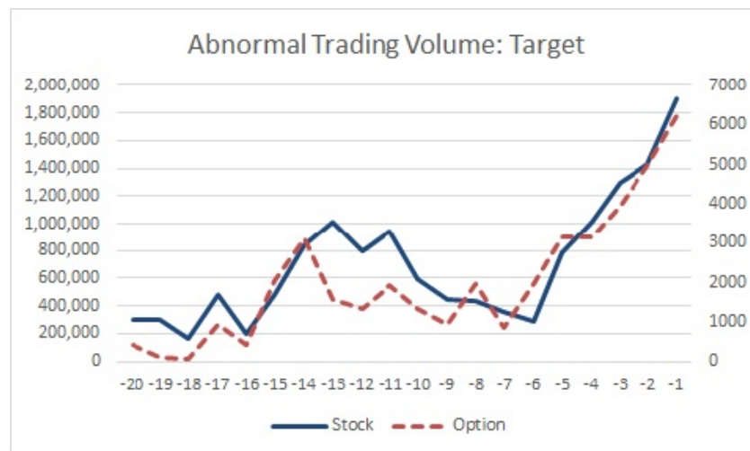
Figure 2. Stock and Option represent the average daily abnormal trading volume of targets’ stocks and options over the 20-day period prior to the announcement, respectively.

Figure 2 presents how the average abnormal stock and option trading volume evolves over the 20-day period prior to M&A announcements for targets. The trading activities are much heavier for targets. The abnormal stock trading spikes and reaches 1,902,197 and the abnormal option trading reaches 6227 contracts the day right before an announcement. This is in line with the well documented effect that M&A announcements usually trigger significant positive shifts in targets’ stock prices. It is also consistent with the findings by Augustin et al. (2019) regarding the prevalent informed trading activities of the target prior to the announcement.